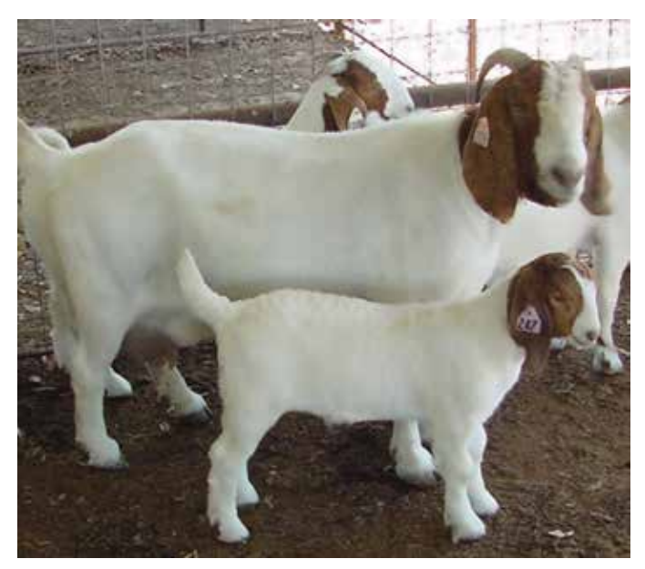
Figure 14-2. Proper record-keeping allows producers to keep an accurate inventory of their herds.

cord-keeping system usually is done by personal preference. Several are available that produce similar reports and summary information. When choosing a program, producers should pick one they are comfortable using. Producers may want to check into what programs have workshops available to demonstrate how to use the program for agriculture. One such workshop is the Quicken for Farmers Workshop offered by the Oklahoma Cooperative Extension Service.