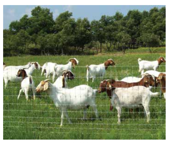
Figure 12-10. Net wire or field fencing.

ed solely of this material would not be tall enough to prevent some animals from escape. Woven horse mesh with 2-inch by 4-inch spacing can be found in 100-foot and 200-foot rolls and ranging from 48 to 72 inches tall. V-mesh also is available in 165-feet rolls and with a choice of 50-inch or 58-inch heights.