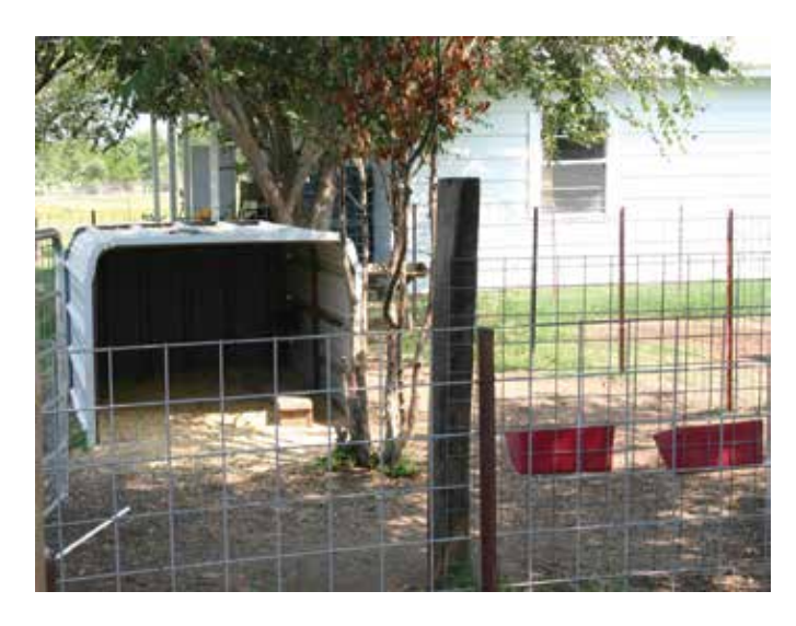
Figure 12-4. Kidding pen.

Ideally, in barns with concrete floors, location and size of kidding pens should be considered prior