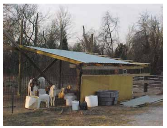
Figure 12-1. Open housing example.

The roof should be sloped to drain runoff to the rear of the structure, and should be situated where drainage is not a problem. Such sheds designed spe-