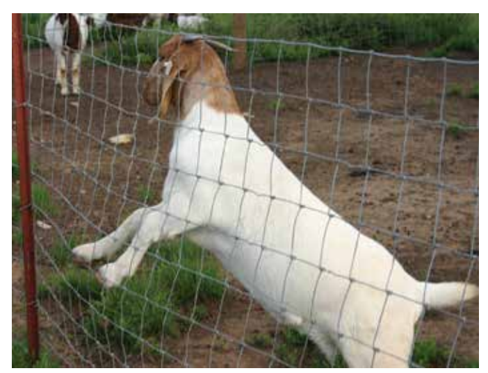
Figure 12-8. Leaning on a fence can eventually cause it to bow down.