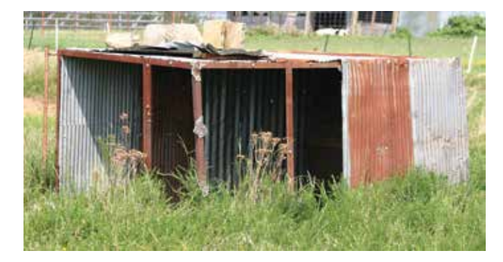
Figure 12-6. Alternative housing example.

Goats have been called the "Houdini" of the animal kingdom. It has been said, if daylight or smoke will pass through a fence, a goat can escape from it. While these are exaggerations, a germ of truth remains: Goats are extremely intelligent and will, on occasion, manage to escape from what appears to be a goat-proof barrier. Regardless of the construction, problems will inevitably arise, but following the "5 P Law" (Prior Planning Prevents Poor Performance)