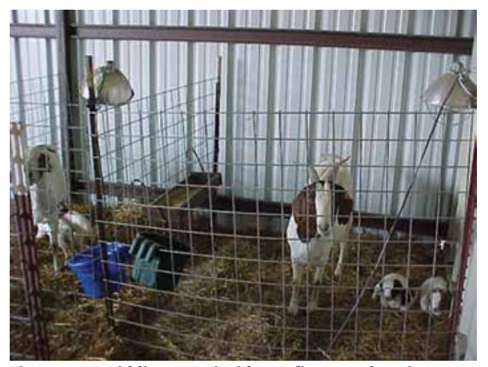
Figure 12-5. Kidding pens inside confinement housing.

to construction. If this is not an option, pens may be added by securing one or more sides to the wood or metal supports for the barn (posts, studs, pipe, etc.).