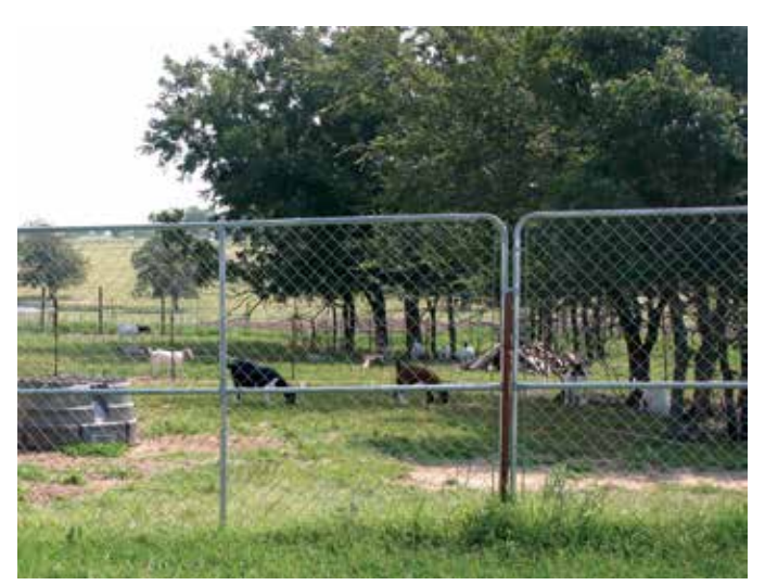
Figure 12-9. Chain link fencing.

Disadvantages: Chain link fence is heavy and may be difficult to install. Due to the relatively small diameter of posts for chain link fence, cement is recommended, especially for corners, braces and gate posts, to prevent the fence from leaning. Horned goats occasionally become entangled. Some animals may try to climb chain link. Repeated