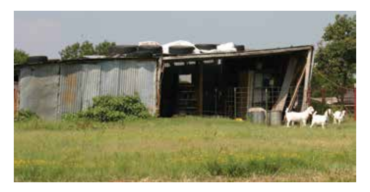
Figure 12-3. Confinement housing example.

ing from using or modifying an existing structure, as seen in Figure 12-3 or building a simple barn to an elaborate facility. Floors may be of dirt, wood or concrete. Regardless of the type of construction or the materials involved, there are several necessities that must be included in the structure.