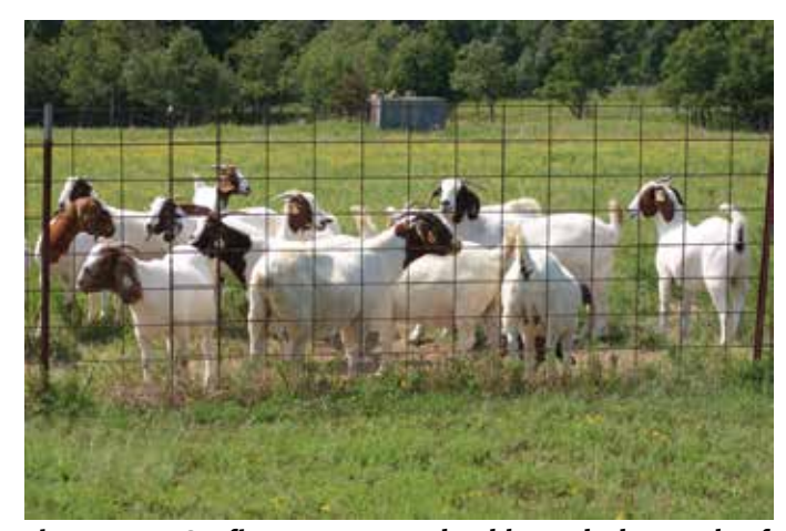
Figure 12-7. Confinement areas should match the needs of the herd.

Once the problem of location has been resolved, the goat rancher must determine the size and shape of corral needed. Most sources recommend a minimum of 25 square feet of floor or ground space per animal. The shape of the pen should also be considered. If the confinement is to be used for exercise of one or two show animals or meat goats, a long, narrow run may be preferred, due to the fact that an animal will get more exercise in this design than in a square pen with the same area in square feet. If a larger number of animals will be confined, more conventional shapes will be adequate. A word of caution is appropriate here, however. Goats, like all herd animals, will frequently "pile up" in corners,