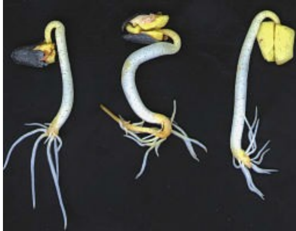
Cotton seedlings exhibiting chilling injury

The two seedlings below show normal root development. When the two groups are compared it may be noted that seedlings injured by chilling are often short with thickened hypocotyls and radicles, dead root tips, and show some signs of lateral root growth.