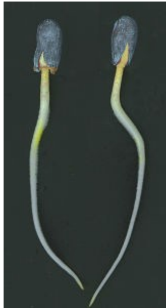
Normal cotton seedlings

The two seedlings below show normal root development. When the two groups are compared it may be noted that seedlings injured by chilling are often short with thickened hypocotyls and radicles, dead root tips, and show some signs of lateral root growth.