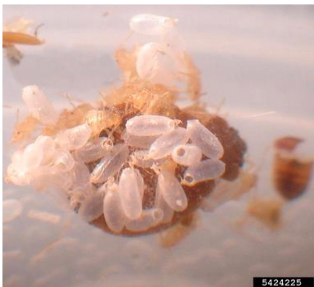
Figure 5. Bed bug eggs.