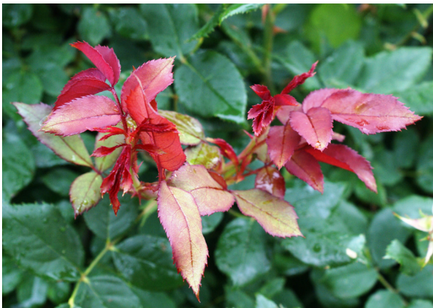
Figure 2. Normal new growth on many roses is red. This should not be confused with symptoms of RRD.