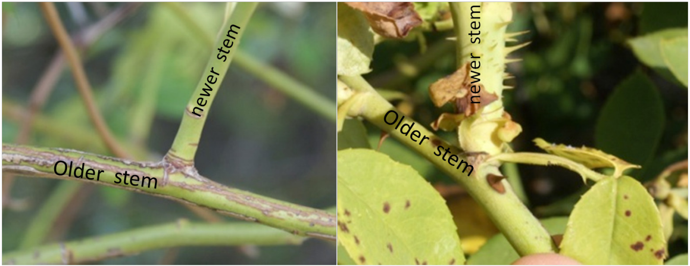
Figure 8. On a normal cane (left), the new shoot has a smaller diameter than the older growth. RRD may cause a thickening of the stem (right), so the newer growth is thicker and more succulent than older growth.