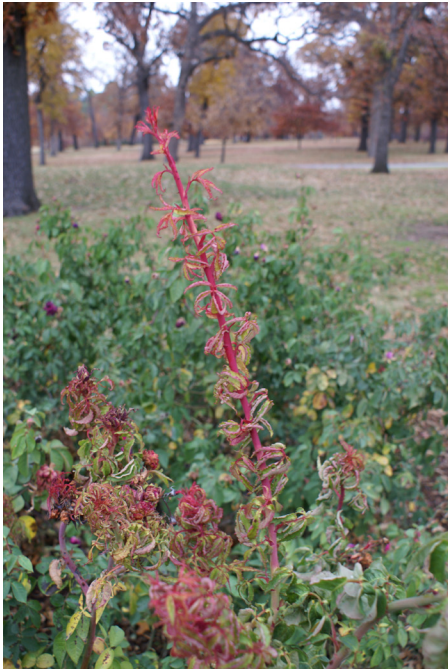
Figure 1. Rose rosette disease (RRD) causes elongated rose shoots, leaf distortion and an unusual red or yellow mottling of the leaves.