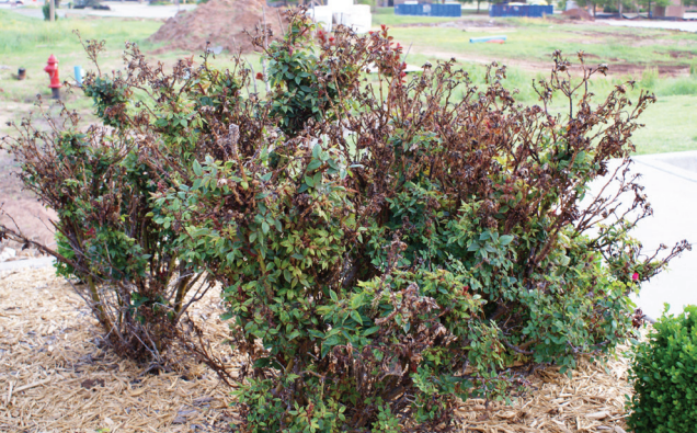
Figure 9. Diseased roses should be removed, since they harbor the virus and the mite. Often, the plants are not removed until they are visually unappealing.