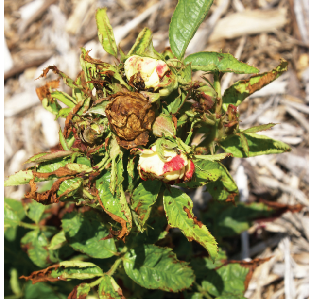
Figure 7. Blooms may show discoloration, mottled color or fail to open normally.