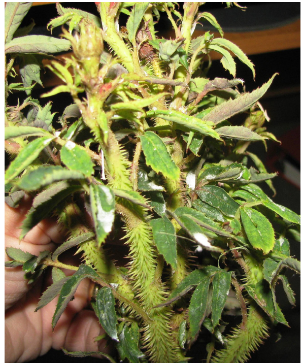
Figure 4. An excessive number of prickles (thorns) on shoots is a symptom of RRD.