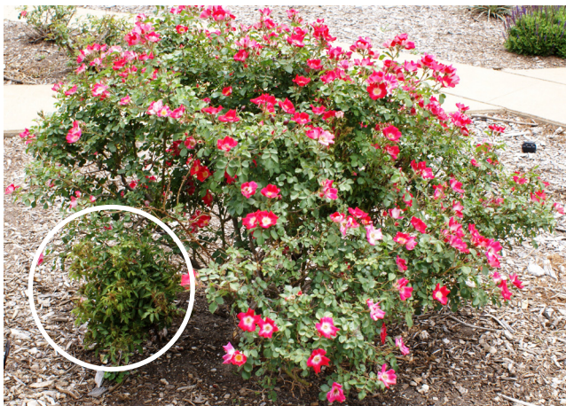
Figure 6. One portion of this rose (bottom left) shows witches' broom and leaf discoloration caused by RRD.

open flowers and sepals, at the base of shoots, leaf axils, or under leaf scars (Figure 11). The mite acquires RRV when it feeds on infected plants. The disease is transmitted when an infective mite vector feeds on the plant. A few weeks to months after infection, plants will begin to develop symptoms of RRD. The mites crawl short distances on rose plants, but they can be carried further distances by wind currents, blowing to new roses. Infective mites can also be carried to new sites on gloves, clothing, or tools. Both the mite and virus are specific to roses ( Rosa spp.); no other hosts have been identified. The mites survive the winter by hiding near or within buds, spent flowers, leaf axils, or leaf scars. The virus may be inactive during the winter, but symptoms will appear on new growth emerging in the spring.