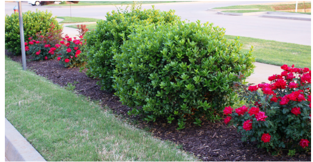
Figure 12. Mixed plantings of roses and non-host material may slow the spread of RRD in landscape plantings.

progress to determine if resistance or tolerance is present in cultivated roses. There is no cure once a plant is infected. Growers have attempted to remove symptomatic canes by pruning, however pruning is often ineffective. The microscopic mites may remain on the plant and/or recently infected canes, which may not exhibit symptoms for many months or the virus may survive in the root system. Therefore, it is recommended to remove symptomatic plants at the first evidence of the disease, including the root ball. Dead heading roses throughout the season may be useful since mites accumulate around the open blooms. Maintaining proper health and vigor of roses in the landscape may be helpful.