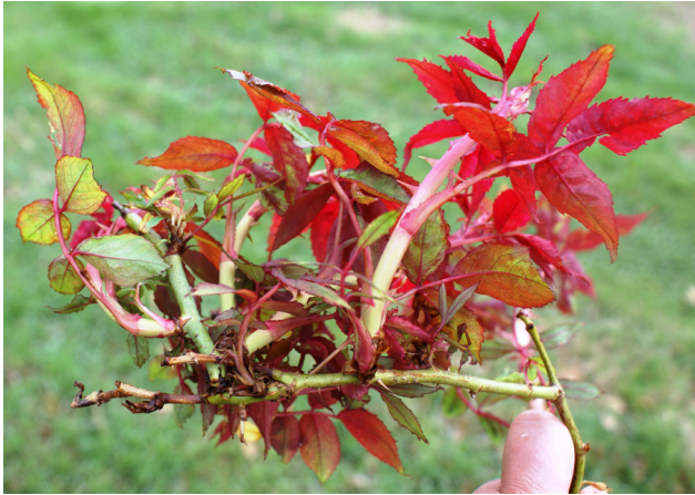
Figure 5. RRD causes rose shoots to have a cluster of shoots emerging from nearly the same point on the stem resulting in a witches' broom (rosette) appearance.