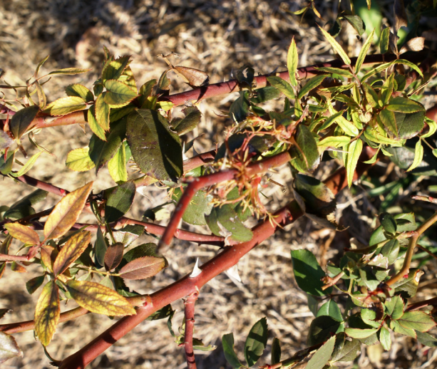
Figure 10. Leaf distortion and yellowing of a rose caused by drift from herbicide use in the landscape.