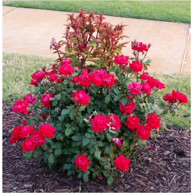
Figure 3. The healthy new growth on this rose has developed into dark green foliage with normal flowers. The section at top center is affected by RRD and continues to show leaf distortion, discoloration and may fail to flower.