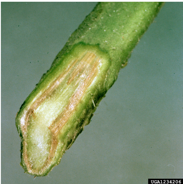
Figure 2. Fusarium wilt—Internal discoloration of stem.

Control: Growing tomato varieties resistant to Fusarium wilt is the most effective means of control. Improved varieties and hybrids are available that have resistance to races 1 and 2; and 1,2 and 3. Resistant varieties can become susceptible to