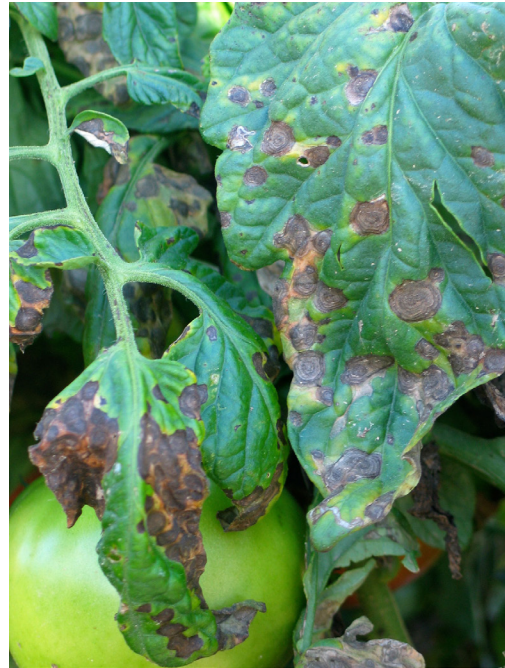
Figure 4. Early blight—Leaf symptoms are large (up to 1/2 inch diameter), brown, zonate or target-like spots.

Control: Crop rotation and thorough shredding and incorporation of infested plant residue soon after harvest are recommended to reduce Septoria leaf spot. Weed control should be maintained because jimsonweed, horse nettle and nightshade are also sources of infection. Drip is recom-