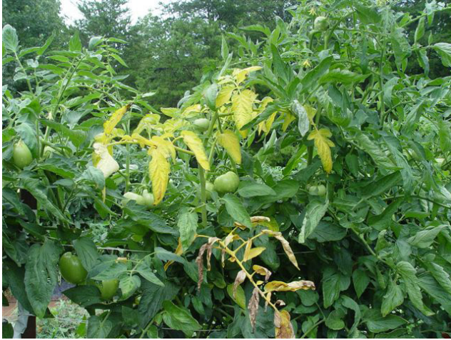
Figure 1. Fusarium wilt—Initial symptoms are yellowing and wilting of branches and later, entire plants

cut, a reddish-brown discoloration can be seen between the pith (center of the stem) and the outer green part of the stem (Figure 2).