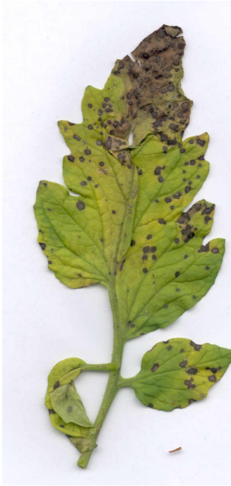
Figure 5. Septoria leaf spot —Leaf symptoms are small (1/8-inch diameter) spots with gray centers and dark borders.