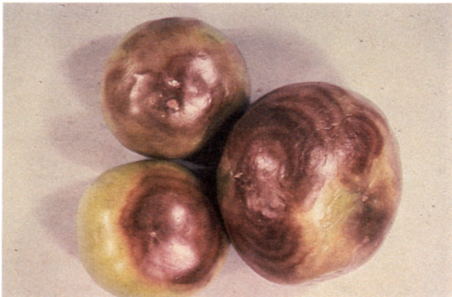
Figure 8. Buckeye rot —Brown concentric rings resemble markings of a buckeye chestnut.

soil frequently splashes onto fruit. When temperatures are warm (more than 80 F) the spot rapidly enlarges to cover up to half of the fruit diameter. The rot then appears brown with concentric rings that resemble the markings of a buckeye chestnut (Figure 8). The disease is most severe in poorly drained areas.