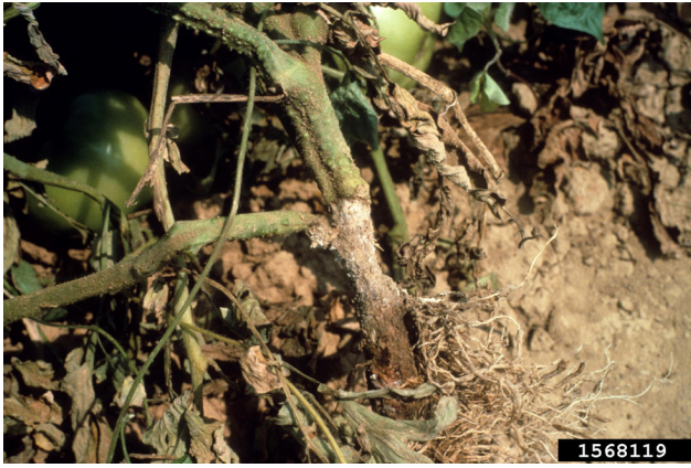
Figure 3. Southern blight—White moldy growth (mycelium) and basal stem canker.

lower plant. Sunken, dry lesions occur most frequently on the stem end of the fruit and also have a zonate or “target-like” appearance.