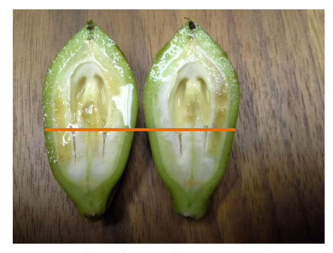
Figure 2: Kernel view if cut along line A in Figure 1. The orange line indicates how far the kernel sack has extended.