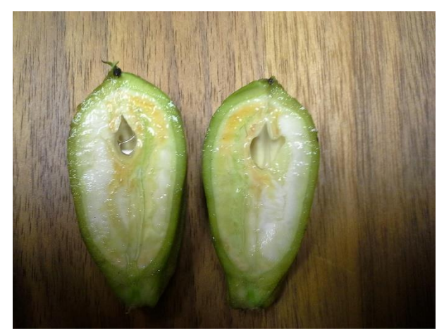
Figure 3: View if cut along line b, only shows the two kernel halves.