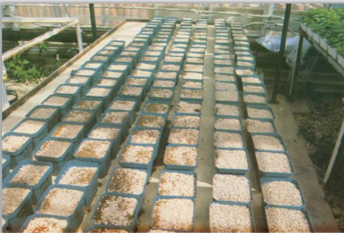
Figure 1. Unseeded pots amended with poultry litter and commercial fertilizer after 6 weeks.

Hopefully this data illustrates that the reason we see more weeds following litter application is the same reason we see more after applying commercial sources of fertilizer...the essential fertilizer nutrients that promote all plants to grow.