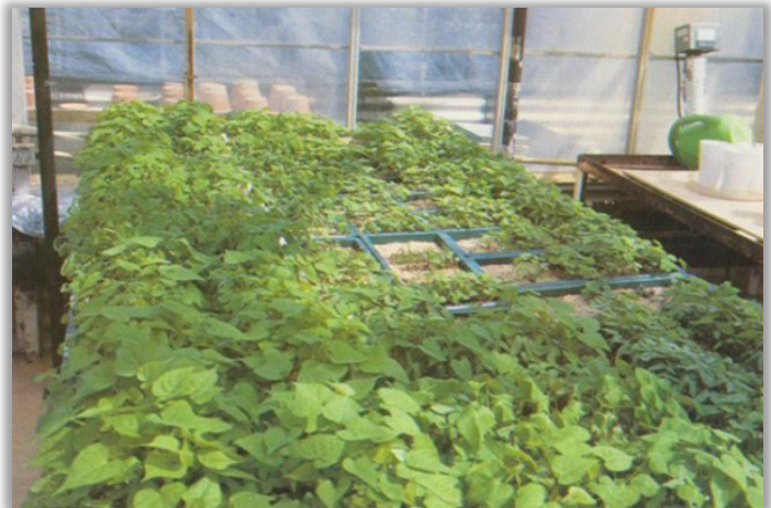
Figure 2. Pots seeded with weed seeds and amended with poultry litter and commercial fertilizer.