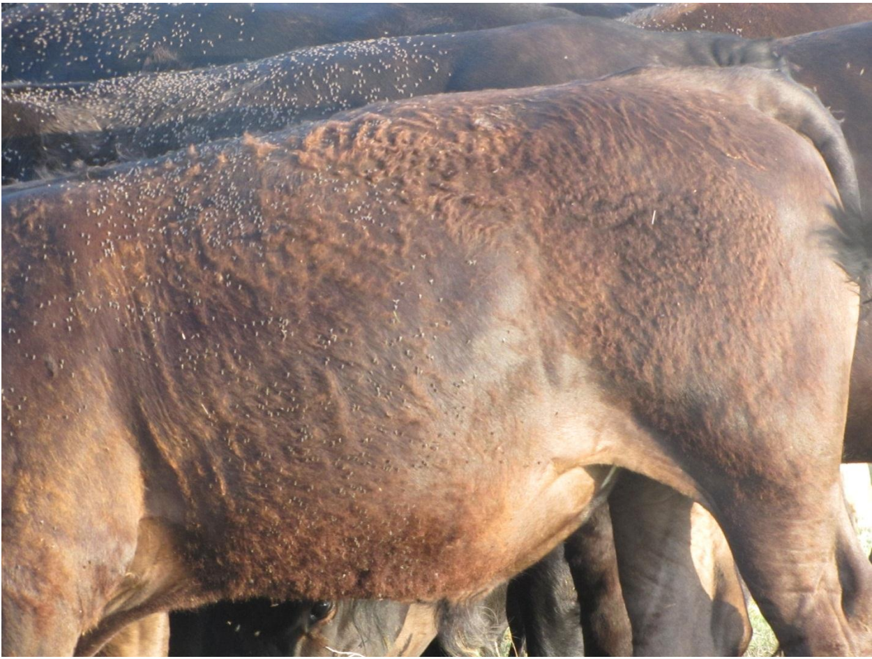
Figure 2: Horn flies on a set of 7 wt. stocker steers. This picture was taken on 7/22/11 near Bartlesville, OK.