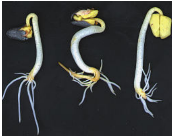
Cotton seedlings exhibiting chilling injury

The three seedlings below were subjected to chilling temperatures during the imbibition phase. During the first six hours of imbibition, the damaged seedlings were exposed to a temperature of 40 degrees F°. After the chilling period they were moved to a chamber set at 86 degrees F° for two to four days. The curling, shortening and thickening of the roots are typical of imbibitional chilling injury. The chilling during this phase of imbibition injures and typically kills the root tip meristematic tissue. This results in cessation of normal taproot growth. Subsequently, lateral roots develop to compensate for this loss. Typically these seedlings may survive and produce productive plants if additional stresses such as water deficit or disease are not encountered.