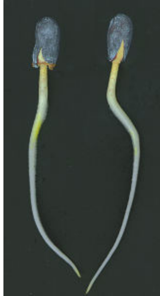
Normal cotton seedlings