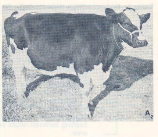
Figure 1 (A). Cow given a score of "8" on the dairy cow condition score system.