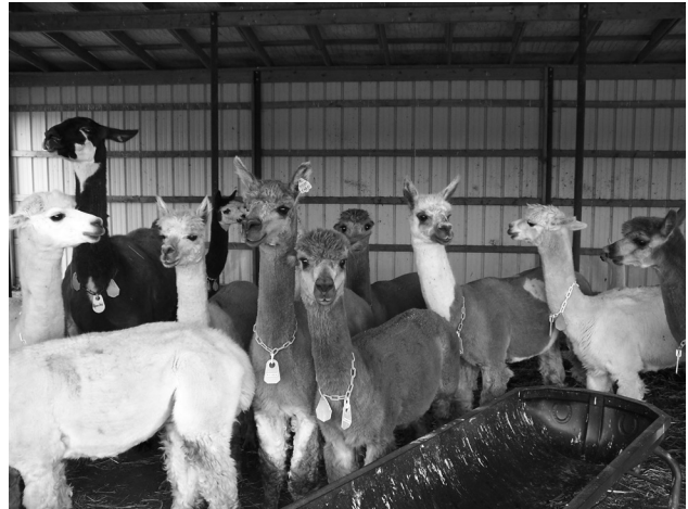
Llamas and Alpacas are easy to train and work with.

Oklahoma Cooperative Extension Fact Sheets are also available on our website at: http://osufacts.okstate.edu