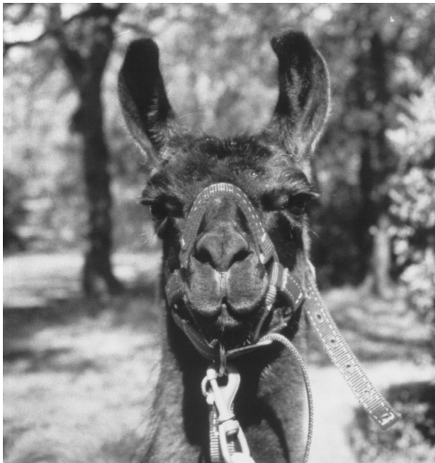
Llamas have a split upper lip.

Oklahoma State University, in compliance with Title VI and VII of the Civil Rights Act of 1964, Executive Order 11246 as amended, Title IX of the Education Amendments of 1972, Americans with Disabilities Act of 1990, and other federal laws and regulations, does not discriminate on the basis of race, color, national origin, gender, age, religion, disability, or status as a veteran in any of its policies, practices, or procedures. This includes but is not limited to admissions, employment, financial aid, and educational services.