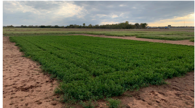
Figure 3. Alfalfa variety trial, Chickasha.

Even though every alfalfa variety has its own yield potential dictated by its genetics, the actual forage yield that each variety can achieve is limited by field conditions and management practices. The pasture's latitude, length of the growing season, temperature, rainfall amount, distribution, soil texture, fertility and other management practices are the major factors that dictate the final forage yield of a specific alfalfa variety. Therefore, choosing a variety by the yield promised on the seed bag is not the wisest decision. Seed companies test their products in the best weather, soil conditions and use the best management practices possible to show the full potential of their products. The odds that your pasture will replicate these same conditions are very low. A more applicable alfalfa variety