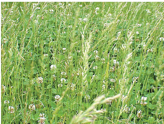
Figure 6. A thick stand of white clover and tall fescue in a pasture.

In early spring while soil is cool, little N fixation takes place, and both legumes and grasses utilize N stored in the soil. Soil N comes from N-containing organic matter and N fixed in previous years. As soil N is depleted and soil warms, N fixation begins to supply needed N. If nearly all legume plants are consumed (grazed or otherwise harvested), N fixation stops until they have sufficient regrowth for fixation to proceed.