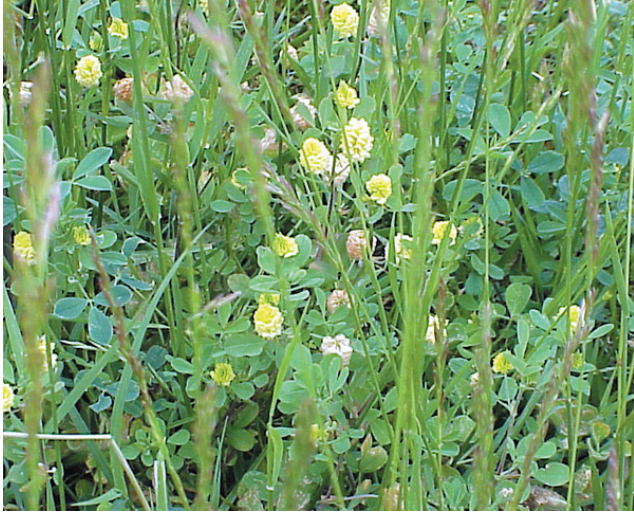
Figure 4. A pasture with a thick stand of hop clover along with tall fescue and other cool-season grasses.