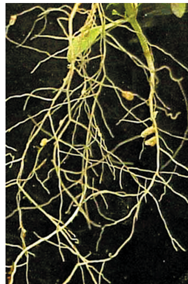
Figure 2. Nitrogen fixing nodules on small legume roots.