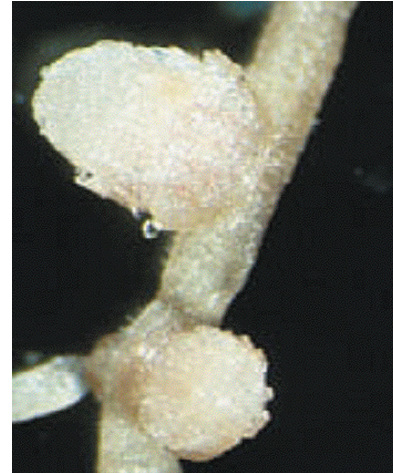
Figure 1. Alfalfa root with two nitrogen fixing nodules.

It is possible to establish legumes without N-fixing bacteria, but forage yield and quality will be similar to grasses. Without Rhizobia, N fertilizer must be applied for high yield and quality, and the economic advantage of using legumes would be lost. In addition, legume forages generally have better quality than most grasses.