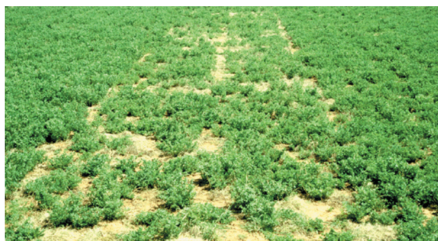
Figure 3. The alfalfa variety in the middle with the thin stand has limited yield and nitrogen fixation potential compared to the adjacent plots.

Legumes harvested for hay or silage fix large quantities of N but contribute a relatively small portion to subsequent crops. Alfalfa is the most important monoculture legume to