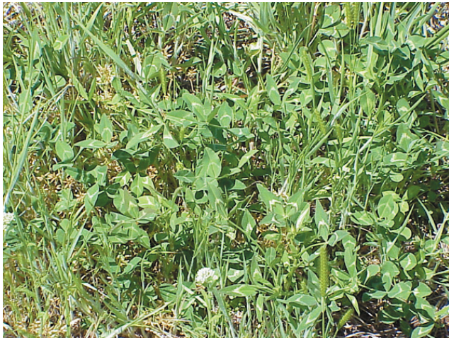
Figure 5. A pasture with arrowleaf clover and white clover growing with forage grasses.