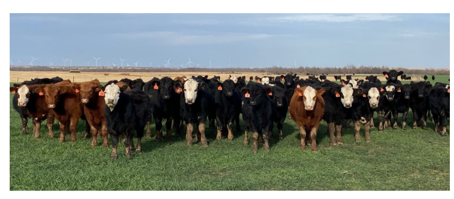
Figure 1. Dual-purpose wheat system. Cattle grazes winter wheat during the winter and should be removed from wheat pasture by first hollow stem stage. Photo taken at Apache, OK.

As early as the 1930s, Kansas State University researchers published Extension bulletins indicating that cattle should be removed from wheat pasture by jointing. Oklahoma State University researchers investigated the issue further in the early 1990s and found that if profitability of the overall wheat stocker cattle enterprise was the primary goal, removing cattle from wheat pasture by jointing was too late. They identified first hollow stem (i.e., the beginning of stem elongation, or just before the jointing stage) as the optimal wheat growth stage for removing cattle from wheat pasture. The purpose of this fact sheet is to explain why first hollow stem is the best time to remove cattle from wheat pasture, provide details on how to identify first hollow stem, and discuss some of the environmental and physiological factors that determine when first hollow stem occurs.