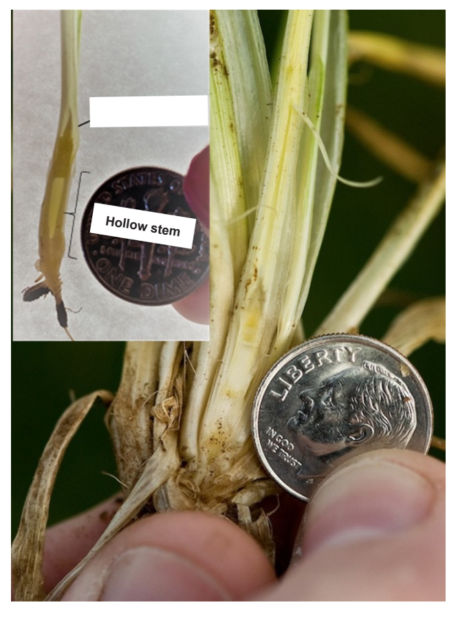
Figure 3. First hollow stem occurs when hollow stem equivalent to the diameter of a dime (1.5 cm) is present below the developing grain head.

Select the largest tillers on the plants. Split the stems open lengthwise starting at the base. A sharp razor or box cutter will make this job easier. If there is 1.5 cm (5/8 inch) of hollow stem below the developing wheat head (Figure 3), the wheat is at first hollow stem stage. The 1.5 cm is about the same as the diameter of a U.S. dime, making the dime a perfect measuring device for first hollow stem.