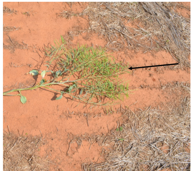
Figure 1. Identify the main raceme of an individual plant. This will be used to determine maturity of the crop.

If growers want to compare combine setup to wheat, the general rule is to slow to about 3/4 of the speed typically done for wheat harvest. This will include ground speed, reel speed and cylinder speed. In addition to speed, the reel should be set high and moved back over the grain table as far as allowed. Fan speed can be set similar to wheat, with no major advantage to slowing the fan speed. Canola is pretty easy to thresh, so opening concave up until whole dry pods are not threshed is better than too narrow and grinding stems, which can increase overall seed moisture. Lastly, make sure the sickle is sharp. A dull sickle can lead to increased shatter loss in front of the combine. If the harvester believes the