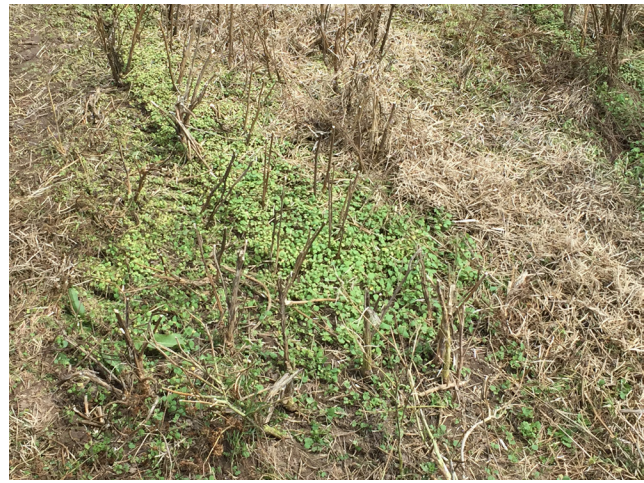
Figure 4. Shattered canola. This is possibly due to late-swathed canola or late-harvested standing canola. Appropriate timing on swathing can minimize this issue.

Overall, canola harvest can be a very challenging task. Growers should select which method they would like to harvest canola, then start planning several weeks prior in managing the crop to optimize the intended technique.