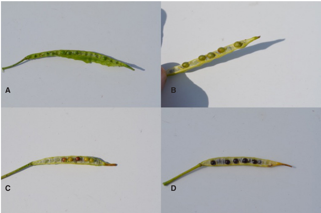
Figure 2. Progression of color change for winter canola at maturity. (A) No color change throughout the pod and some soft seeds. (B) Spotty color change throughout the pod, seeds firm with limited translucent seeds throughout the plant. (C) Color change throughout the pods with spotting on some less mature seeds. (D) Full mature seed color. Swathing can begin when at least 30 percent of pods exhibit pod color change (B and C), swathing at D may result in increased shattering during swathing.

combine is set properly, drive a test cut then get out and look behind the combine. Approximately 115 seeds per square foot is equal to one bushel yield loss per acre.