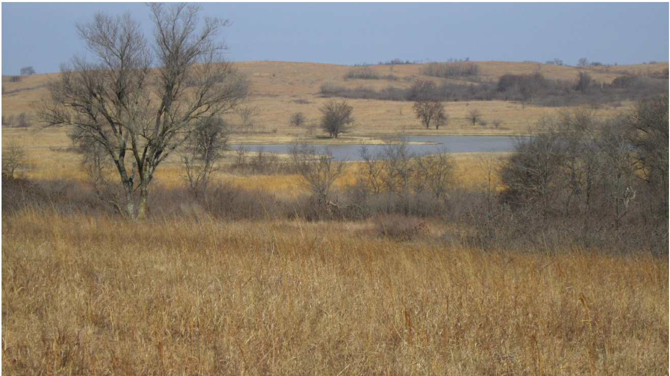
Figure 3. A mosaic of vegetation in eastern Oklahoma that is a good example of bobwhite habitat. Research from this study indicates that open grasslands are ideal environments for scent tracking predators, but tall grass cover and shrub patches can help conceal prey from predators.

and erratically changed direction during very short time periods. This suggests that air-borne odors may be exceptionally difficult for predators to track in forests because the prey may not always be found predictably upwind of the odor. However, dense forests do not provide the necessary grass, shrub and forb cover that quail need in the understory. So, even if odor detection is difficult, dense forest is not quail habitat.