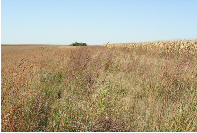
Field buffers around crop fields increase the carrying capacity of the land for pheasants. Wider buffers (more than 60 feet) planted to diverse mixes of native grass, forbs, and legumes can be used by nesting hens and broods. Additionally, birds can forage in the adjacent crop residue during the winter especially if native shrubs are present in the buffer.