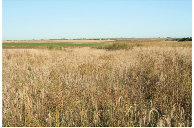
This waterway, was planted to a mixture of native warm season and native cool season grasses, such as switchgrass and big bluestem, rather than introduced grasses. After establishment, it will provide good nesting cover for pheasants and excellent winter and travel cover as it provides a lot of edge for pheasants to feed in adjoining crop fields while still being close to cover (Photo by Jason Sykes, Pheasants Forever).