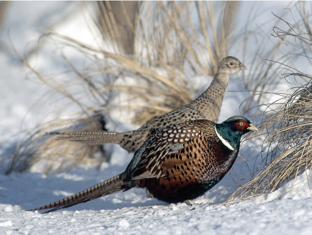
Pheasants are one of the most popular game birds in Oklahoma and the U.S.

Oklahoma Cooperative Extension Fact Sheets are also available on our website at: http://osufacts.okstate.edu