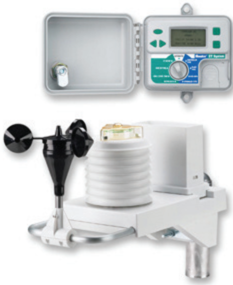
Figure 1. Evapotranspiration based controller.

Evapotranspiration controllers have been shown to reduce outdoor water use. In Las Vegas, Nev., homes with ET based controllers saw an average of 20 percent irrigation reduction compared to homes with homeowner-scheduled irrigation (Devitt et al., 2008). Additionally, a study conducted on St. Augustine turfgrass showed an average irrigation savings of 43 percent in the summer compared to homeowner-scheduled irrigation, with no reduction in turfgrass quality (Davis et al., 2009). The accuracy of ET controllers depends on the equation parameters. Most ET controllers cost between $250 and $900. Professional grade ET controllers range between $900 and $2,500.