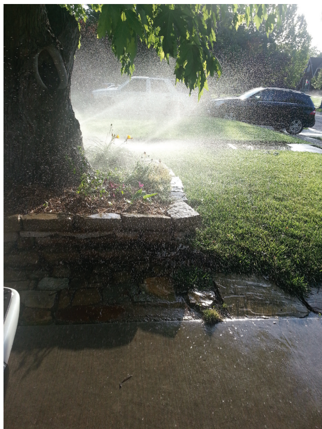
Figure 6. Irrigating during windy conditions wastes water and reduces system efficiency.

The Environmental Protection Agency (EPA) has created performance criteria for irrigation technology manufacturers under the WaterSense program. For more information go to: www.epa.gov/watersense/ . Often, it depends on consumer preference when deciding which irrigation controller or add-on sensor is appropriate for the end user. Many local irrigation distributors have smart irrigation technology available for customers.