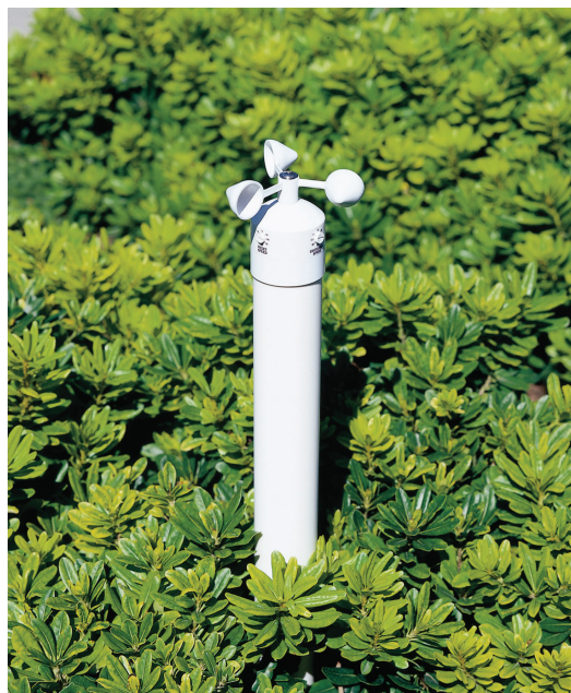
Figure 7. Example wind sensor for use in the landscape.