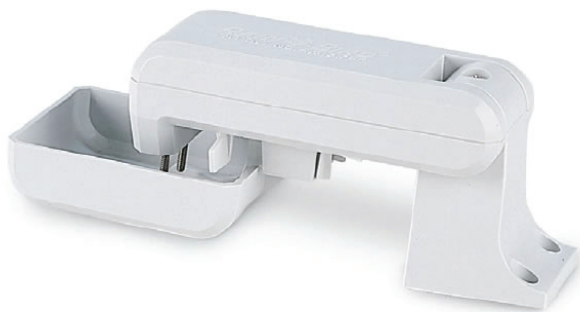
Figure 4. Rain sensor with a small basin to collect rainfall.

they need to be replaced. All of the devices should be mounted in an open area where they will receive rainfall.