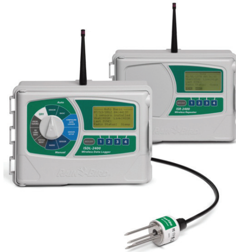
Figure 2. Example of a soil moisture controller.

Similar to ET controllers, soil moisture controllers have been shown to reduce irrigation, while maintaining turfgrass quality. Compared to homeowner irrigation schedules, soil moisture controllers had an average 72 percent irrigation savings and a 34 percent water savings during drought conditions (Cardenas-Laihacer et al., 2010; Cardenas-Laihacer et al., 2008). In some cases, studies have shown smart controllers will increase water use at sites that typically use less than the theoretical irrigation requirement (Mayer and Deoreo, 2010).