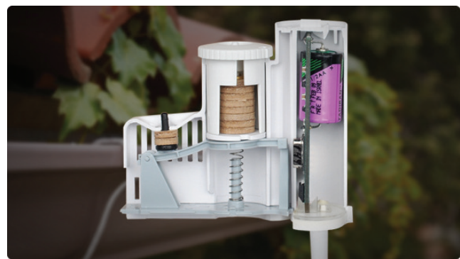
Figure 5. Rain sensor attached to a gutter (top) and the inside of an expanding disc rain sensor (bottom).