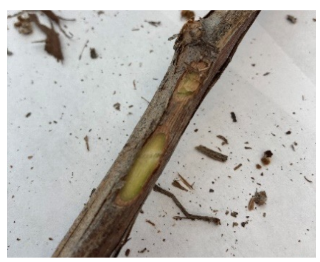
Image 7: A cut cane showing that it's alive. The green tissue shown is the xylem.

Oklahoma State University, as an equal opportunity employer, complies with all applicable federal and state laws regarding non-discrimination and affirmative action. Oklahoma State University is committed to a policy of equal opportunity for all individuals and does not discriminate based on race, religion, age, sex, color, national origin, marital status, sexual orientation, gender identity/expression, disability, or veteran status with regard to employment, educational programs and activities, and/or admissions. For more information, visit https://eeo.okstate.edu.