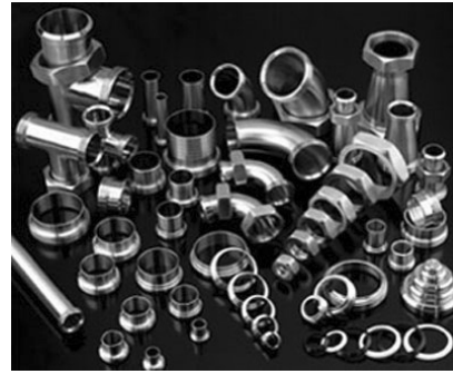
Figure 2. Bevel seat fittings