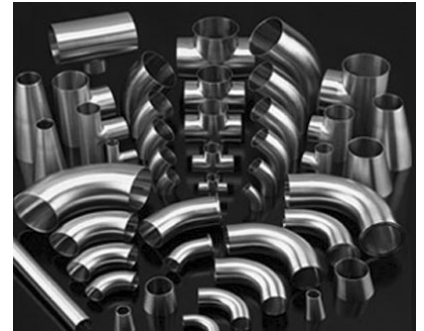
Figure 2. Bevel seat fittings