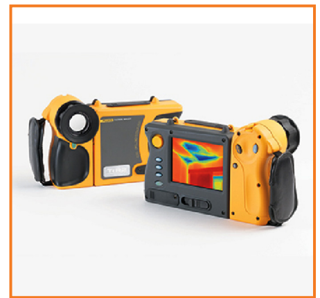
Figure 4. Infrared camera by Fluke Corp. www.fluke.com