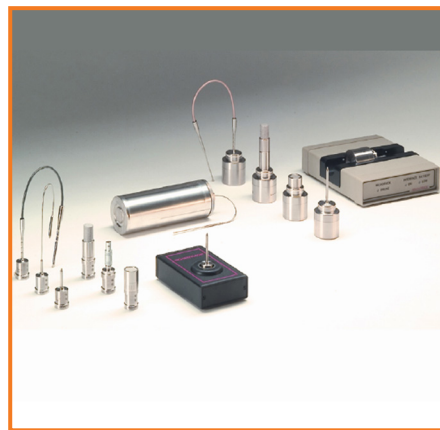
Figure 3. Datatrace data logging system by Mesa Labs. www.mesalabs.com