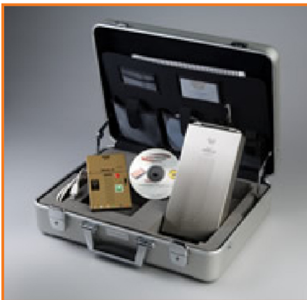
Figure 2. Super Mole Gold temperature data logger by ECD. www.bakewatch.com

Gas oven systems in food processing operations are often overlooked as a source of waste. Many systems are inefficient and pose potential food safety and quality hazards. A wide variety of resources, tools and techniques are available to help diagnose and improve oven systems. Identifying and repairing problems in ovens can be a rewarding experience that results in increased cash flow and improved food quality. As energy prices continue to rapidly increase, the efficiency of oven systems is even more important.