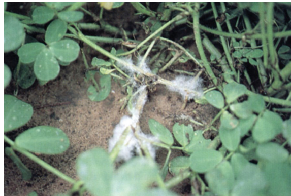
Figure 5. White, fluffy mycelium of Sclerotinia growing on infected stems in a wet canopy.

Plant to plant spread of Sclerotinia blight is limited because the fungus does not produce airborne spores during the growing season. Sclerotia may germinate and form a small, cup-shaped mushroom which produces airborne spores. In Oklahoma, these spores are produced in the early spring, several weeks before peanuts are planted. Spread of the disease within the canopy occurs only by direct contact of healthy and diseased plant parts. Conditions favoring active growth of the fungus also favor spread to healthy plants. Centers of diseased plants occur in fields because of the limited distance which secondary spread occurs. Centers of blighted plants become more numerous as concentrations of sclerotia in soil increase. Sclerotia are also the primary means of long distance spread of Sclerotinia blight.