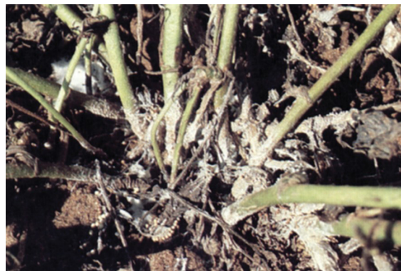
Figure 2. Mycelium of the southern blight fungus at the base of an infected plant. Note the sclerotia developing on the leaf litter.