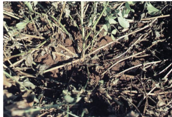
Figure 6. Vines killed by Sclerotinia blight are pale white or straw-colored.