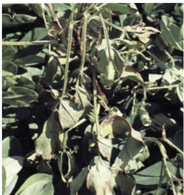
Figure 1. Wilted plant or “flagging” from either southern blight or Sclerotinia blight. The base of this plant must be closely examined to determine which disease is the cause.