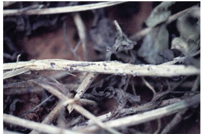
Figure 7. Small, irregularly shaped, black sclerotia of Sclerotinia .

Sclerotia are easily moved from field to field with soil or infested peanut straw. Movement of farm implements from infested to clean fields is an important means of disease spread. Research in Oklahoma has also shown that sclerotia fed to cattle in infested peanut hay can pass through the digestive tract of cattle and remain viable. Sclerotia may be then deposited with dung in clean fields. Sclerotia are also small and light enough to be moved with wind-driven soil. Water moving over soil infested with Sclerotinia may also move sclerotia within fields or to nearby