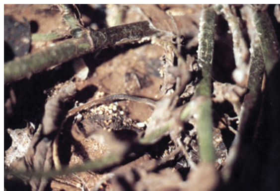
Figure 4. Close-up of the small, uniformly round sclerotia of the southern blight fungus.

of water should be avoided as prolonged periods of canopy wetness favor disease development.