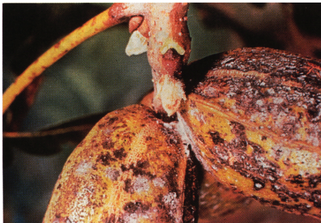
Fig. 1. Scab lesions on shuck of a pecan nut. The pink mold fungus is growing in some lesions.

With more effective, safer fungicides on the market and better information on scheduling fungicide applications, making decisions about using fungicides to control pecan scab does not have to be as difficult as it was in the past. We have an arsenal of fungicides that can be counted on to control scab when used correctly and wisely without sacrificing personal safety, food safety, or the environment. Scheduling of applications can be made using recommendations that are keyed to plant development stages or the OSU Pecan Scab Model available on the Internet. Both of these methods have been widely tested under Oklahoma growing conditions. The level of intensity of fungicide programs will be different for natives as compared with cultivars and for cultivars with different levels of susceptibility to pecan scab. If cattle are grazed in native groves, decisions will have to be made that are best for overall production and profit of that farm unit. Considering the low profit margin for native pecans, some growers may not be convinced that the cost of a fungicide program is a sound investment for natives. If scab fungicides are applied to natives when they are not needed or when there is not a nut crop to protect, the investment is certainly unsound. But it is an equally unsound decision not to apply fungicides to natives when they are needed.