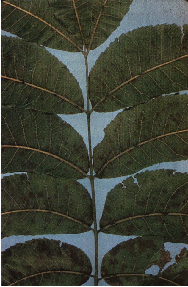
Fig. 3. Liver spot symptoms on an infected pecan leaflet.