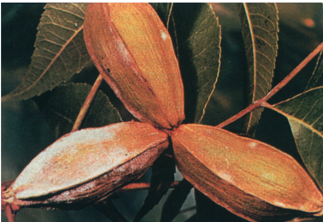
Fig. 4. Powdery mildew symptoms on infected nut shucks.