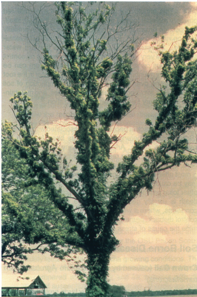
Fig. 7. Symptoms of bunch disease of pecan trees.

Scheduling of fungicide applications using the phenological method. There are two basic methods for deciding when to apply scab fungicides. The first, the phenological method, is based on the plant growth stages or phenology of pecans and is weighted heavily toward protecting the nut crop by preventing disease on nut shucks. The phenological method covers the critical periods of pecan crop development. It errs on the side of safety and may result in an application being made that is unnecessary. For natives and more resistant cultivars a maximum of three applications are applied. The initial application is made at the same time as the first pecan nut casebearer application, and for natives this means that the decision to apply fungicide can be made once it is certain that a good nut crop has set. A first cover application is made two to three weeks after that and is followed by a second cover application two to three weeks later. With this method a fourth application is needed for moderately to highly susceptible cultivars at the pre-pollination stage about five weeks after bud break.