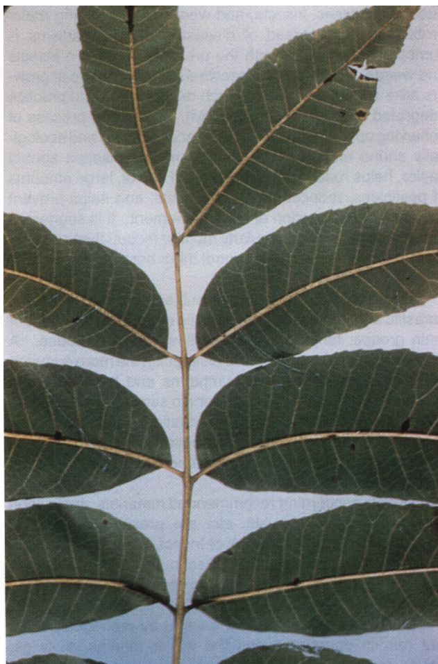
Fig. 2. Vein spot symptoms on an infected pecan leaflet.