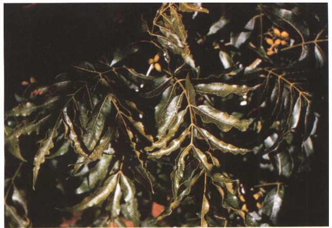
Fig. 5. Early symptoms of zinc deficiency (rosette) of pecan leaflets.