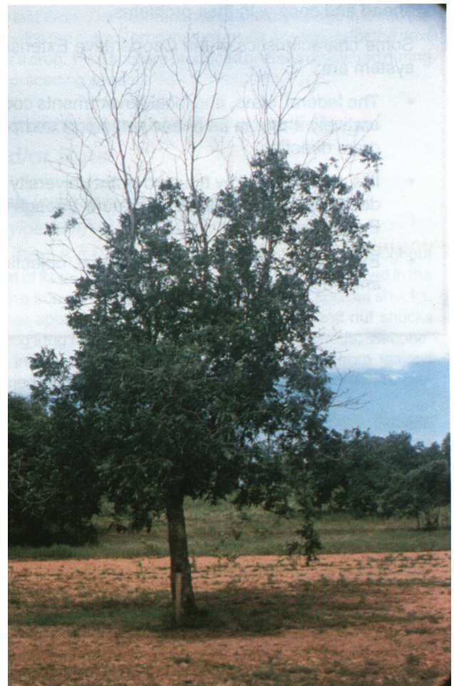
Fig. 6. Death of branches of a pecan tree because of a long-term zinc deficiency.