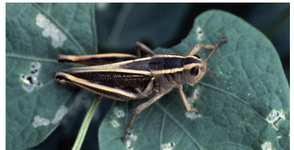
Figure 2. Two-striped grasshopper.

Grasshoppers can become a problem in row crops and small grains. They tend to injure corn, soybean, cotton, and wheat, and do not feed heavily on sorghum or peanuts. Corn and soybean are likely to suffer defoliation in late summer and fall, including damage to the ear of corn or the soybean seed pod. Late planted cotton can suffer stand loss when seedlings and young plants are attacked by grasshoppers. Winter wheat is more vulnerable to damage in the fall which can result in stand loss.