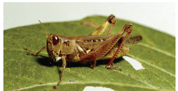
Figure 4. Redlegged grasshopper.