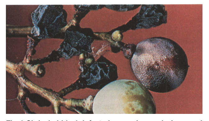
Fig. 4. Shriveled, black, infected grapes (mummies) covered with sexual fruiting bodies of the black-rot fungus.

The information given herein is for educational purposes only. Reference to commercial products or trade names is made with the understanding that no discrimination is intended and no endorsement by the Cooperative Extension Service is implied.