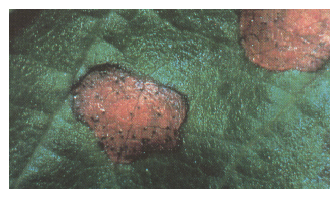
Fig. 2. Development of fruiting structures of the black-rot fungus in infection spots (lesions) on a leaf.