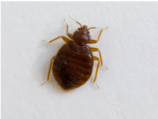
Figure 1. Adult bed bug.