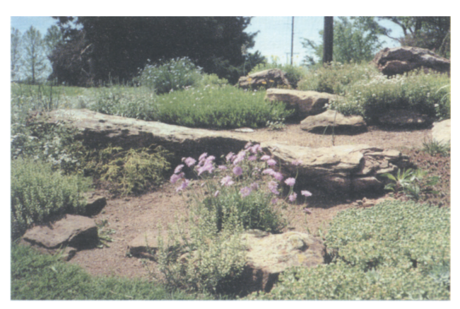
Figure 6. Rocks with flat tops should be positioned so that rain and irrigation water flows backwards into the slope.

In nature, large boulders sometimes have cracks or crevices that provide ideal growing conditions for some plants. This feature can be re-created by positioning two similar rocks with flat faces next to each other, leaving a