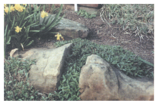
Figure 7. The imitation of a split rock, created by positioning two similar stones inches apart, provides an ideal planting spot.