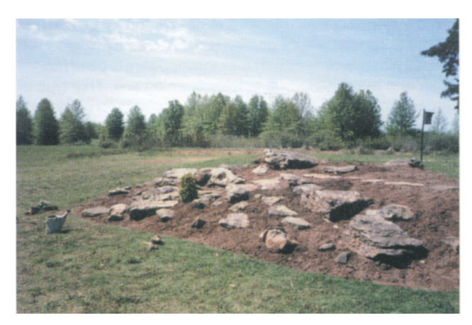
Figure 3. A natural effect can be achieved by arranging the rocks to imitate a series of tilted layers of strata.