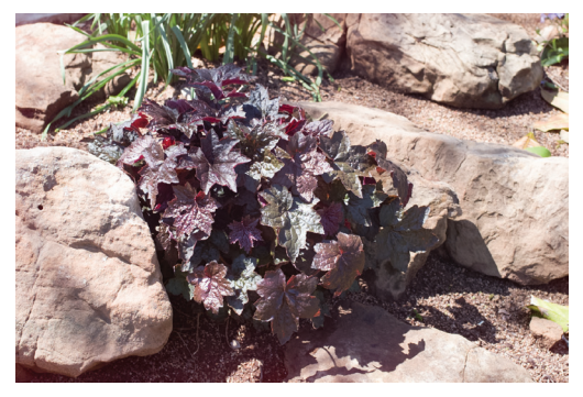
Purple Coral Bells – Heuchera micrantha, var. diversifolia 'Palace Purple'