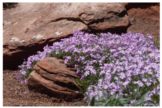
Candy Stripe Phlox – Phlox subulata 'Candy Stripe'