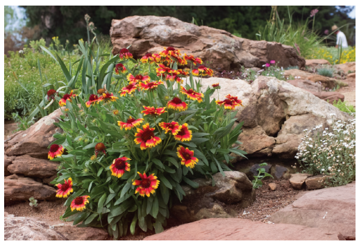
Goblin Gaillardia – Gaillardia x grandiflora 'Kobold'