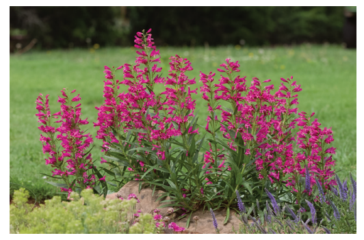
Cambridge Penstemon – Penstemon barba tus 'Cambridge'