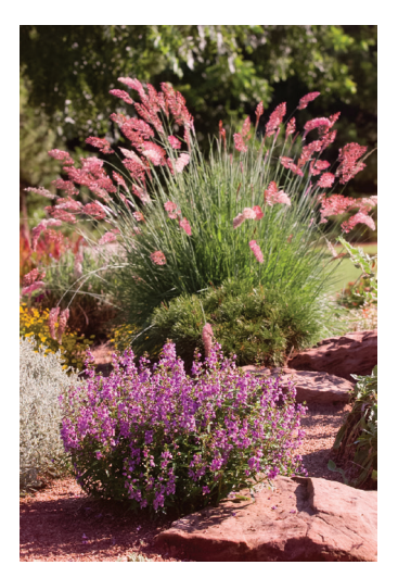
Ruby Grass – Rhynchely trum nerviglume 'Pink Crystals' (back) Angelonia – Angelonia an gustifolia (front)