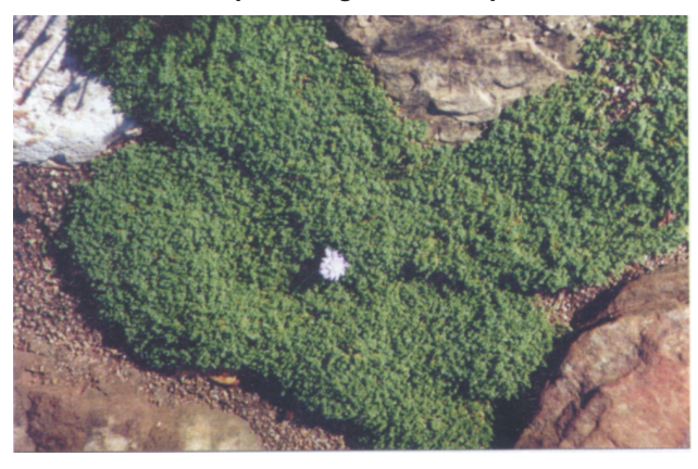
Figure 10. Rupturewort ( Herniaria glabra ), makes a nice carpet of green between rock garden stepping stones.

Proper clothing and footwear should be worn when constructing a rock garden. Leather gloves, long pants, and steel-toed boots are necessities during construction.