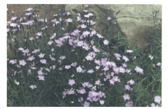
Bath's Pink Dianthus – Dianthus gratianop olitanus 'Bath's Pink'