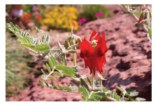
Desert Pea – Swainsona formosus (syn. Clianthus f. )