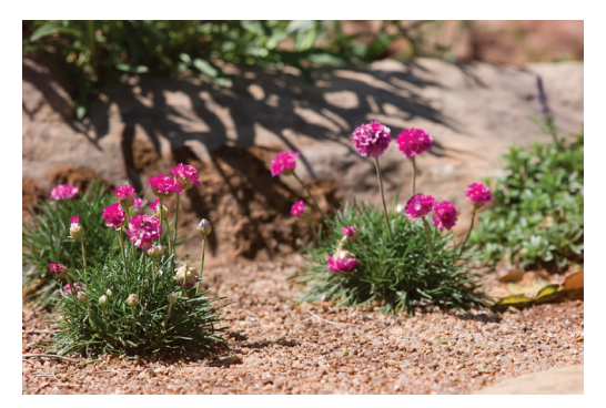
Thrift – Armeria maritima