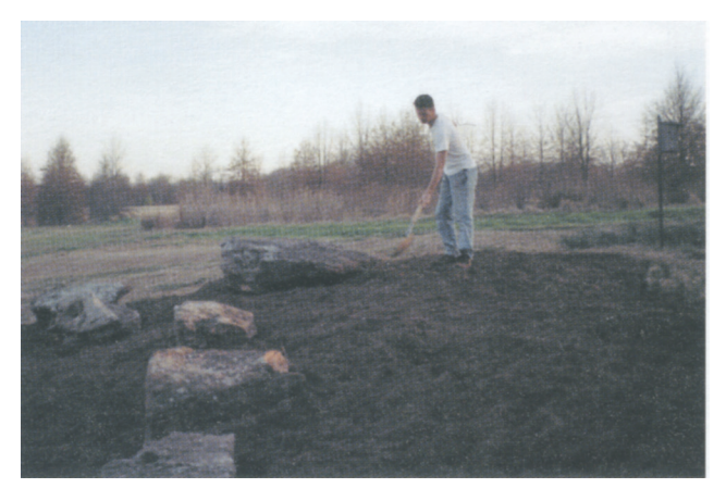
Figure 4. Creating the appearance of a disintegrated layer of strata begins with the placement of several large rocks in a row with their lines running in the same direction. Gaps between rocks simulate sections that have broken free and tumbled downhill.

To emulate nature, begin by placing a few strong lines of rock in rows at different heights. Be certain their strata lines all continue in the same direction. Use the largest rocks for these first layers. Tilting lines of strata as in Figure 3, seem to give a more natural look than do level lines.