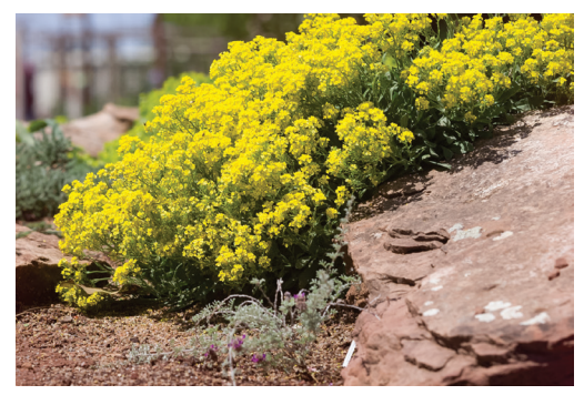
Basket of Gold - Aurinia saxatilis