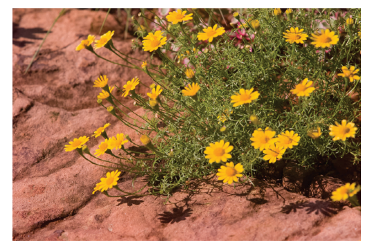
Dahlberg Daisy – Thymophylla tenuiloba (syn. Dyssodia t .)