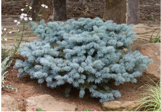
Dwarf Globe Blue Spruce – Picea pungens 'Globosa'