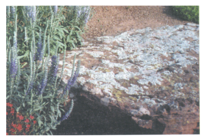
Figure 8. Highly desiragle mosses and lichens add character and color to the surfaces of the rocks they occupy.

small gap. The crevice can then be filled with soil and planted (Figure 7).