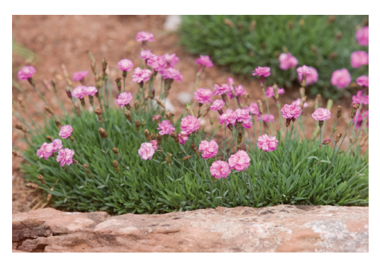
Tiny Rubies Dianthus – Dianthus gratianop olitanus 'Tiny Rubies'