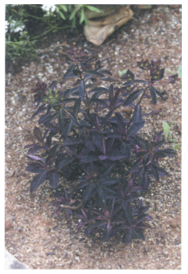
Chameleon Spurge – Euphorbia dulcis 'Chameleon'