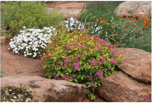
Magic Carpet Spirea - Spiraea 'Magic Carpet'