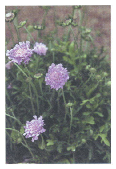
Pink Mist Pincushion Flower – Scabiosa columaria 'Pink Mist'