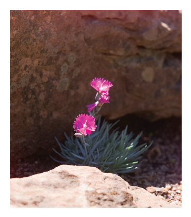
Firewitch Dianthus – Dianthus gratianopolitanus 'Feuerhexe'