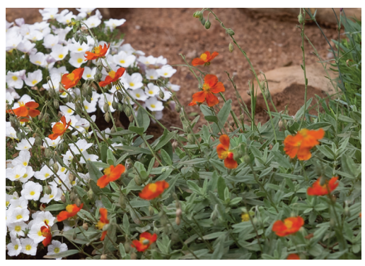
Rock rose – Helianthemum 'Henfield Brilliant'