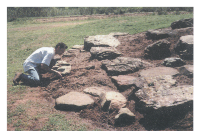
Figure 5. Each layer resembles a crumbled terrace made up of either large or small rocks.

Place tumbled sections randomly throughout the layers (Figure 5). Begin at the bottom of the slope if a large quantity of rock is to be used and the terraces overlap one another. A less dense grouping of the strata layers provides a more weathered prairie out-crop appearance, and will allow more space for plants. Increasing the distance between layers may not necessitate beginning at the bottom of the slope.