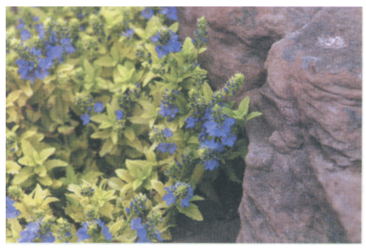
Golden Speedwell – Veronica prostrata 'Trehane'