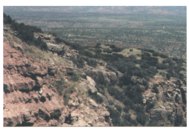
Figure 2. Many exposed sedimentary rock formations are characterized by their visible layers or strata lines.

One of the most noticeable features of natural sedimentary rock formations are their layers of strata (Figure 2). The appearance of lines in the rock occurs as the result of years of continuous deposition. These lines continue in the same direction from rock to rock unless portions have crumbled away due to weathering. The strata lines generally run horizontally, but may be vertically oriented on occasion.