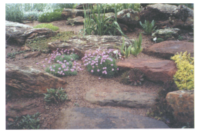
Figure 9. A natural looking pathway, winding through the rock garden, provides many small planting areas and offers close-up viewing of several plants.

Good judgment and extreme caution must be used when working with rocks. Rocks are often heavier than they look, and aren't easy to handle. Machinery should be used, whenever possible, to lift and move the rock. Smaller rocks can be lifted and moved by hand by bending at the knees and lifting with the legs, not your back. Instead of lifting, rocks can be rolled or flipped over repeatedly to position them. A soil ramp can be formed to roll smaller rocks uphill into place.