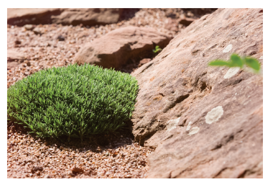
Cheddar Pink – Dianthus gratianopolitanus 'Sterkissen'