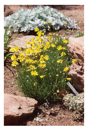
Perky Sue – Hymenoxys scaposa