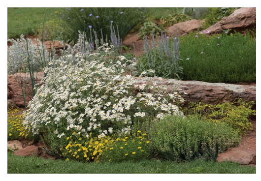
Silver Tansy – Tanacetum niveum