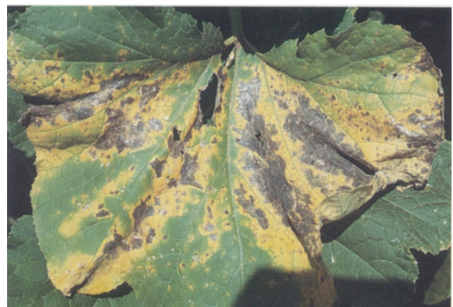
Figure 4. Angular leaf spot on pumpkin leaf.

This leaf spot disease has been of minor importance in Oklahoma, but it does occur on cantaloupe and watermelon. Fruit are rarely infected, but defoliation, which results from leaf infections,