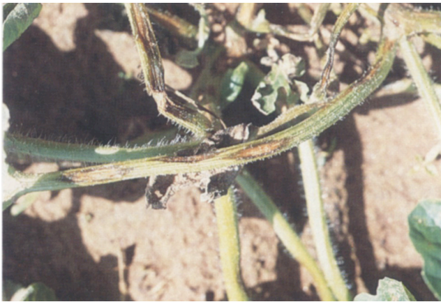
Figure 2. Anthracnose lesions on watermelon stem.