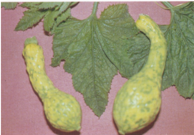
Figure 13. Mosaic virus symptoms on squash fruit.

is not effective because insecticides do not kill aphids before they infect plants. Reflective mulches, which repel aphids are partially effective. The use of summer forage grass strips ( sorghum x sudan ) between rows of cucurbits can help reduce the spread of aphids that spread virus diseases. Weed management should be practiced in and around cucurbit fields. Cucurbit plantings, particularly those planted late in the season, should not be situated near or downwind of other fields or areas known to be infected with a virus.