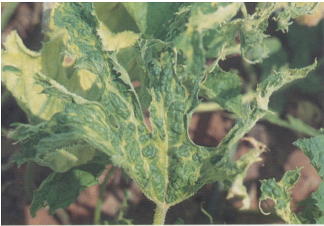
Figure 12. Mosaic virus symptoms on pumpkin leaf.