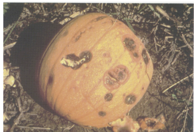
Figure 10. Black rot of pumpkin.