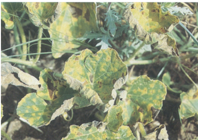
Figure 7. Downy mildew on cantaloupe leaves.

The fungus causes fruit rots of cucumber, squash and pumpkin most often in storage. A black blossom end rot occurs on immature cucumber fruit in the field. More commonly, water-soaked spots appear anywhere on fruit after harvest. Gummy exudates may develop within these spots. Infected fruit later develop black discoloration. On pumpkin and winter squash, black rot symptoms appear as water-soaked areas, which later become sunken and black in color (Figure 10). Tiny dark fruiting bodies develop within