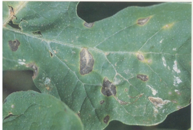
Figure 1. Anthracnose leaf spots on watermelon leaf.

The anthracnose fungus overwinters on infected debris from previous cucurbit crops. The first infections on the new crop are caused by spores produced on