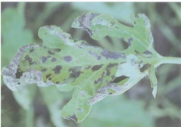
Figure 8. Downy mildew on watermelon leaf.