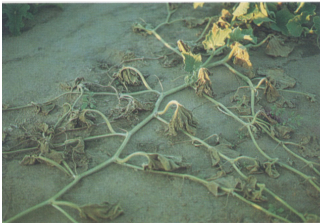
Figure 14. Wilt symptom on cantaloupe vine.