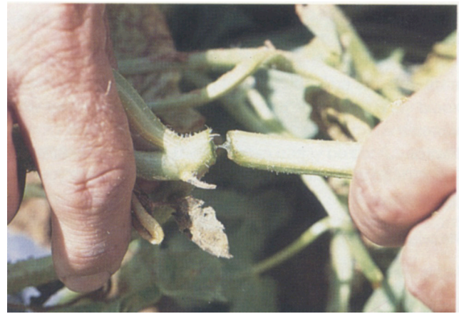
Figure 16. Diagnosis of bacterial wilt of cantaloupe.

Bacterial wilt is severe on cantaloupe and cucumber and less damaging on squash and pumpkin, and rarely affects watermelon. The bacterium is spread by cucumber beetles (striped and spotted) and occurrence of the disease is always associated with beetle feeding. Symptoms first appear as dull green, wilted areas on leaves. Later, individual runners and then entire plants wilt and die. A field diagnosis can be made by pressing the cut surfaces of a wilted stem together and observing the sticky threads that form when the stems are slowly pulled apart (Figure 16). The wilt bacteria overwinter