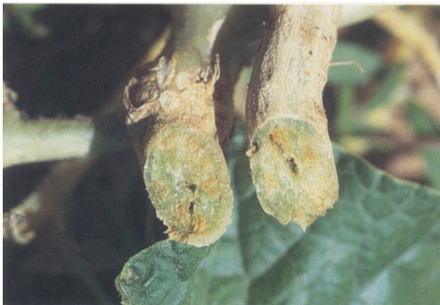
Figure 15. Stem discoloration caused by Fusarium Wilt .

Fields with a known history of wilt problems should be avoided. Only long crop rotations (six-year minimum) will rid a field of the wilt fungi, but shorter rotations will help limit the increase of the fungus and development of races capable of attacking resistant varieties.