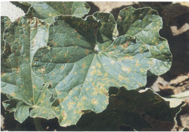
Figure 5. Alternaria leaf spot on cantaloupe leaf.

reduces fruit size and quality. The fungus survives in contaminated debris from old cucurbit crops for up to two years. Initial infection is from airborne spores. Thereafter, spores produced on leaf spots serve to increase disease levels when long periods of leaf wetness occur.