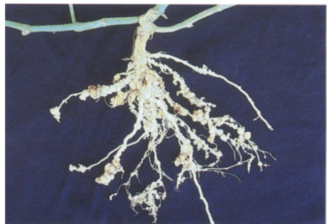
Figure 17. Symptoms of root-knot nematode on cantaloupe.

Control is best achieved with crop rotation with non-host crops (grasses). Laboratory analysis of soil samples is encouraged for soils in which nematodes have been a problem. Nematode damage may also increase levels of Fusarium wilt and various root rots.