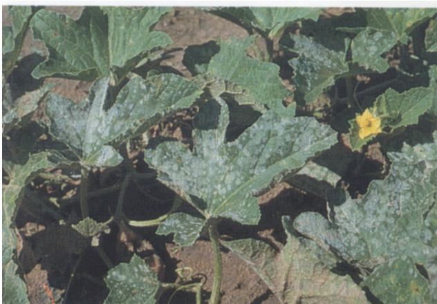
Figure 11. Powdery mildew on cantaloupe leaves.

Cercospora leaf spot is most common on watermelon, cantaloupe and cucumber and is mainly confined to leaves. Spots appear first on older leaves and may become numerous. Spots are circular to