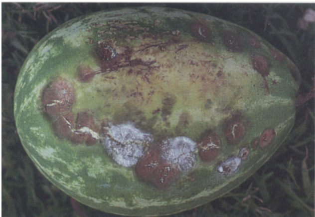
Figure 3. Early and advanced symptoms of Anthracnose on watermelon fruit.

the debris. These spores are carried to plants by splashing rain or running water. Thereafter, disease increase is a result of infection by spores produced on new lesions, which are spread in the same manner. The fungus also may be seedborne and introduced into clean fields on contaminated seed. Anthracnose is managed by crop rotation, resistant varieties and fungicide sprays. Anthracnose may