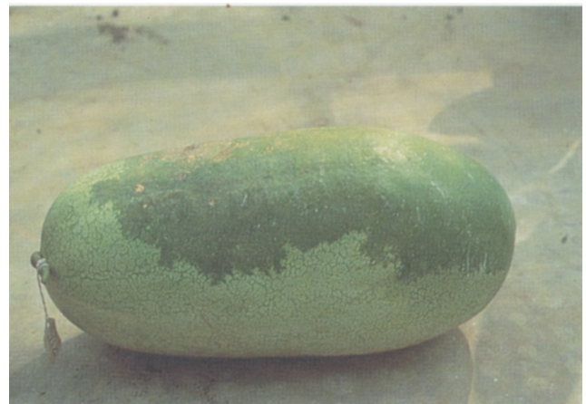
Figure 6. Bacterial fruit blotch of watermelon.

Symptoms of downy mildew are variable, depending on both weather conditions and the host crop, but are almost always confined to the leaves. The oldest leaves are usually attacked first. On cucurbits other than watermelon, symptoms first appear as pale green areas on otherwise healthy leaves, which turn to yellow angular spots confined by leaf veins (Figure 7). With moist conditions, a downy layer of fungal growth may be seen on the underside