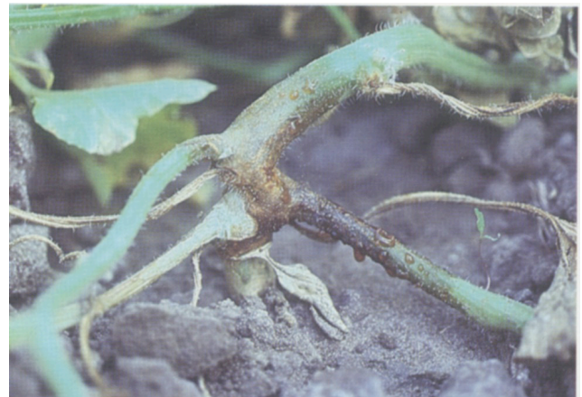
Figure 9. Gummy stem blight lesion on cantaloupe stem.