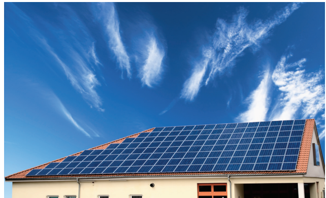
Figure 1. Solar PV Panels on Home Roof (powerupelectric.com).

Oklahoma Cooperative Extension Fact Sheets are also available on our website at: http://osufacts.okstate.edu