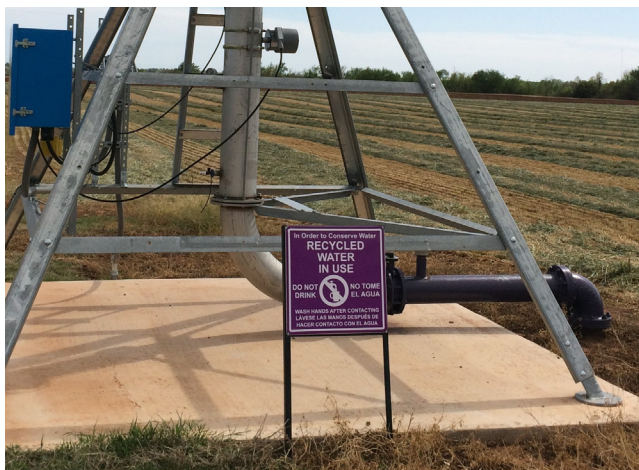
Figure 3. Reclaimed water is used for forage irrigation at the OSU South Central Research Station near Chickasha, OK.

Reclaimed water distribution systems have special requirements to protect public health from potential contact. Pipes carrying reclaimed water are required to be purple in color, as well as the connected valves and outlets. This piping is also required to be marked with the warning, “CAUTION: RECLAIMED WATER – DO NOT DRINK.” Hose bib connections to the system are required to be in locked vaults below the ground surface. Pump stations within the distribution system are required to be secured from unauthorized access and to have