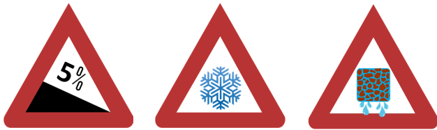
Figure 2. Reclaimed water cannot be applied on slopes more than 5 percent, when the ground is frozen, when soil is saturated or during periods of precipitation.

areas must be controlled by the user and requires fencing and signage. These areas also are required to be separated a certain distance from wells, waterbodies and property lines. If sprinkler irrigation is being used, wind blowing droplets over property lines must be considered. These distances are illustrated in Figure 1. The type of crop that can be irrigated is also based on the reclaimed water category, but no food crop that may be eaten raw can be irrigated with reclaimed water. Also, irrigation should cease 30 days before harvest of processed food crops. Furthermore, any lagoon cell with raw sewage cannot be used as an irrigation source and other water quality conditions must be met.