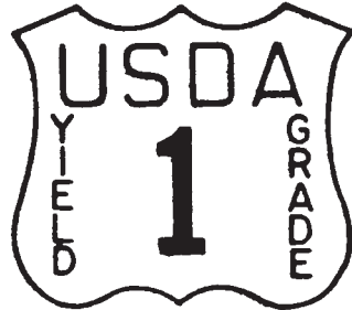
Beef and lamb grading identification labels: quality grade label (top left); yield grade label (bottom right).

thin (inferior). Hog carcasses having adequate quality are assigned one of four cutability grades: No. 1, No. 2, No. 3, or No. 4.