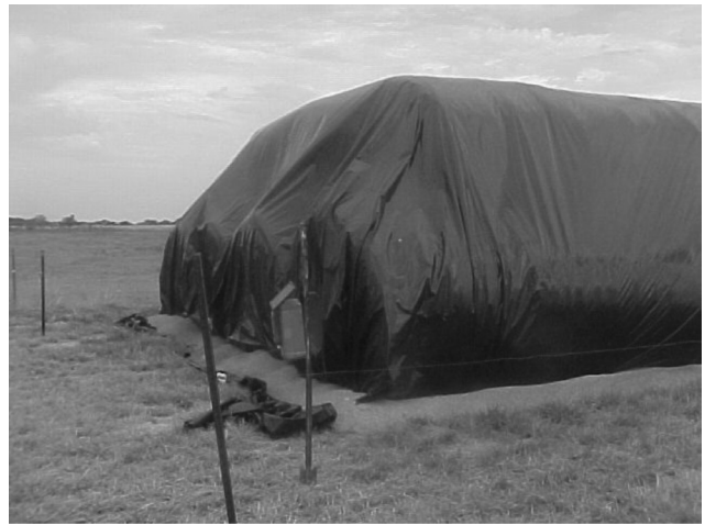
Figure 1. Black plastic sheeting (6 mils thick) covering hay.

Oklahoma Cooperative Extension Fact Sheets are also available on our website at: facts.okstate.edu