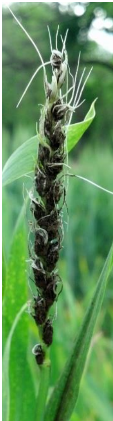
Figure 2. Loose smut (left photo); common bunt/stinking smut bunt balls in a mature wheat head (middle photo; photo credit; Dr. Bill Bockus; Kansas State University); bunt balls of common bunt/stinking smut compared to healthy wheat kernels (right photo).

In contrast to loose smut, common bunt/stinking smut produces 'bunt balls' in wheat heads (Figure 2; middle photo and photo to the right), which break and spread spores onto healthy wheat kernels as well as into the soil in the field. Hence, spores of the common bunt fungus survive on wheat kernels or in the soil and not inside of seed, as is the case with loose smut. In the fall when wheat germinates, the common bunt spores also germinate and infect the young seedling. The fungus then grows with the plant, and as heading occurs and the wheat senesces, bunt balls are formed rather than wheat kernels. Another difference between these two smuts is that no odor is associated with loose smut, whereas a strong musty/fishy odor is associated with common bunt, especially if there is a bad infestation.