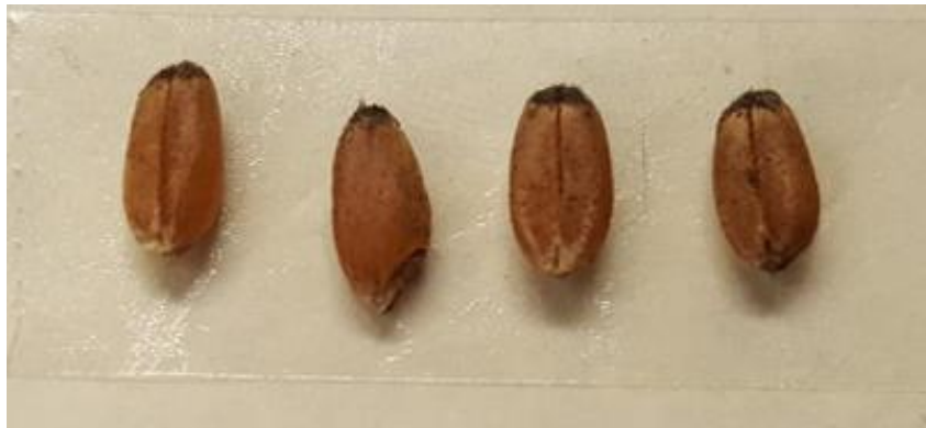
Figure 3. Healthy wheat kernels covered with spores of the common bunt/stinking smut fungus (top two photos). Note the dark color at the top (brush end) of the kernels, which is due to the trapping of thousands of spores in the brush of the wheat kernel (bottom photo).

Recently I have received reports and a sample of wheat grain heavily infested with common bunt/stinking smut. The wheat kernels appear to have blackened tips (Figure 3; top left and top right photos), but in contrast to black tip (Figure 1) where the germ end is darkened, in this case the brush end of the seed is darkened. This blackening of the brush end is caused by thousands of common bunt/stinking smut spores being trapped in the brush (Figure 3; bottom photo). I am bringing this to your attention because although both loose smut and common bunt/stinking smut can create significant problems, both are readily controlled by the use of an appropriate seed treatment. Many such treatments are available. Some are for insects, some are for bunts and smuts, some are for root rots, and many are for a combination of wheat insect pests and wheat diseases. A good starting point as a guide for an appropriate seed treatment is the table on pages 262-263 in the 2020 OSU Extension Agents' Handbook of Insect, Plant Disease, and Weed Control (OCES publication E-832) where many (but not all) of the more common seed treatments are listed. It may not be necessary to plant treated wheat seed every year to manage loose smut and common bunt/stinking smut, but it is much better to manage them preventatively rather than wait until there is a severe outbreak of either one in a field.