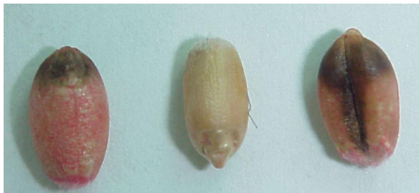
Figure 1. Wheat kernels with black point (photo on the left; note the pinkish color on the two outer wheat kernels, which is a seed treatment that had been applied), and sooty mold on a mature wheat head (photo on the right)

I thought my 5-June update would be my last, but two samples/reports have come in that are prompting another update. One of these reports was wheat kernels with darkened-colored germ ends with the dark discoloration moving toward the middle of the seed and into the crease. This is indicative of black point (Figure 1; photo on the left), which is a discoloration of the seed (typically the germ end of the seed) resulting from either infection by a number of different fungi that typically are saprophytes (living on dead tissue) but can occasionally parasitize living tissue, or from a combination of abiotic (environmental) conditions that promote the discoloration without the presence of an organism. Often black point occurs when freeze damage has occurred, or harvest was delayed and dead tissue in the heads has been heavily colonized by fungi that cause sooty mold (Figure 1; photo on the right). Black point in wheat grain can be a grading factor as the discoloration can result in black flecks in flour milled from such grain. Additionally, if used as seed wheat, kernels with black point can have reduce germination resulting in a lower seedling emergence. Hence, if wheat showing black point is to be used as seed wheat, it is imperative to check the germination of that seed and to use a seed treatment that controls seed and seedling rots.