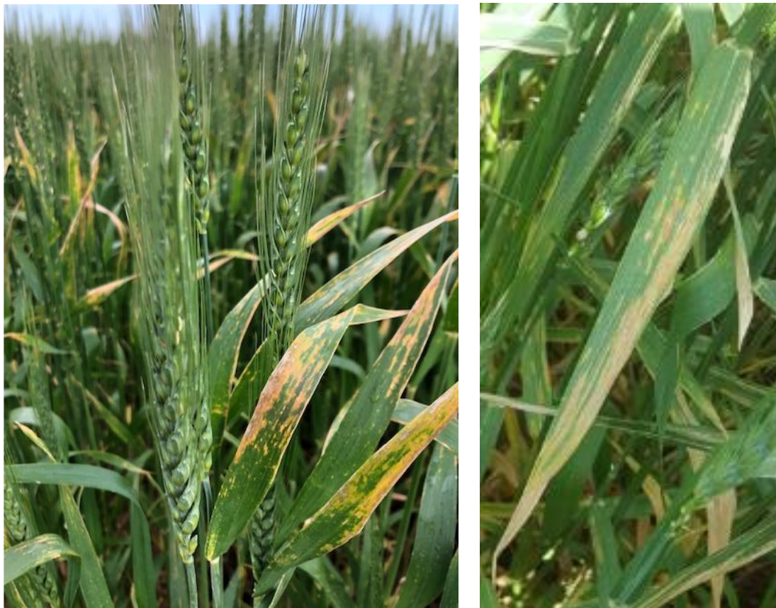
Figure 3. Other upper leaf tissue burning and death does not appear to have a biotic (pathogen/disease) cause, but is may involve freeze damage or some other type of physiologically related cause.

A fungicide application will help manage this upper leaf spotting/burning/browning IF the cause is a pathogen/disease such as stripe rust or Septoria leaf blotch. However, such an application will only protect the remaining green tissue and not be able to reverse any dead area and will not help if the discoloration is due to an environmental factor such as freeze. Also keep in mind that only certain fungicides can be applied through flowering while others have a required time interval between application and harvest. Some have both types of restrictions. Hence, be sure to consult the label to be in compliance with the requirements as described on the label of the fungicide.