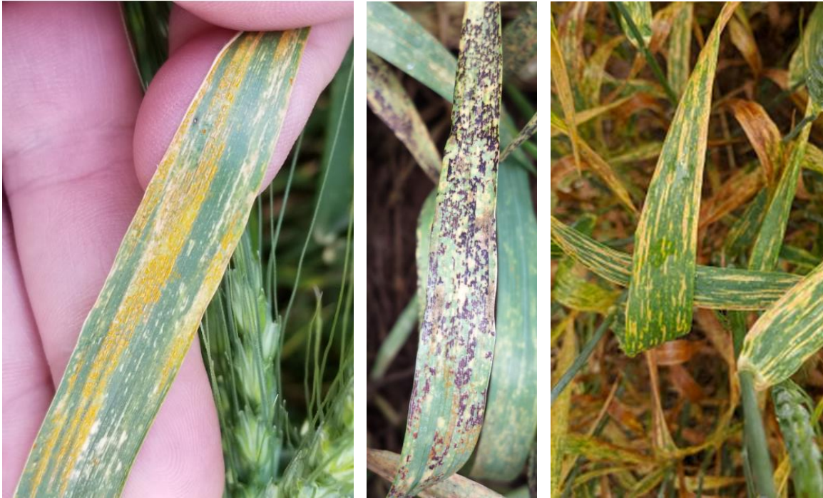
Figure 1. Various expressions of wheat stripe rust observed across Oklahoma the week of April 20th. Leaf with active sporulation of yellowish-orange urediniospores (left photo; Gary Strickland (Extension Educator; Jackson County)), leaf with teliospores (center photo) and leaves with yellowing or dead stripes but with no or little sporulation (right photo).

Septoria leaf blotch (Figure 2) is another disease that is contributing to the upper leaf browning this year. Typically, Septoria leaf blotch on wheat in Oklahoma is restricted to the lower and mid canopy, and only rarely reaches the upper canopy. This year is one of those exceptions.