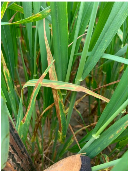
Figure 2. Septoria leaf blotch showing the blotchy, irregularly shaped dead areas on leaves with pycnidia (black pepper spots – photo on the right) formed in the dead leaf tissue. Septoria leaf blotch typically is restricted to the lower and mid-canopy, but this year has been observed on upper wheat leaves (flag and F-1 leaves).

Septoria leaf blotch (Figure 2) is another disease that is contributing to the upper leaf browning this year. Typically, Septoria leaf blotch on wheat in Oklahoma is restricted to the lower and mid canopy, and only rarely reaches the upper canopy. This year is one of those exceptions.