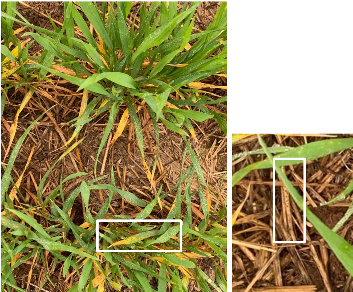
Figure 2. Leaf yellowing and spotting in a wheat field that definitely fits the pattern of tan spot.

At the other end of the spectrum, are samples that have come in such as those in Figure 2 (Zack Meyer, FMC). In Figure 2, the leaf in the white box in the photo on the left is typical of tan spot. Also, note the presence of heavy wheat straw residue on the ground and the presence of the black fruiting bodies of the fungus that causes tan spot on the straw residue (photo on the right).