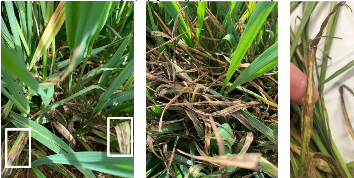
Figure 1. Yellowing and dying of lower leaves most likely the result of leaf senescence followed by colonization of the dead tissue by saprophytic fungi.

At the other end of the spectrum, are samples that have come in such as those in Figure 2 (Zack Meyer, FMC). In Figure 2, the leaf in the white box in the photo on the left is typical of tan spot. Also, note the presence of heavy wheat straw residue on the ground and the presence of the black fruiting bodies of the fungus that causes tan spot on the straw residue (photo on the right).