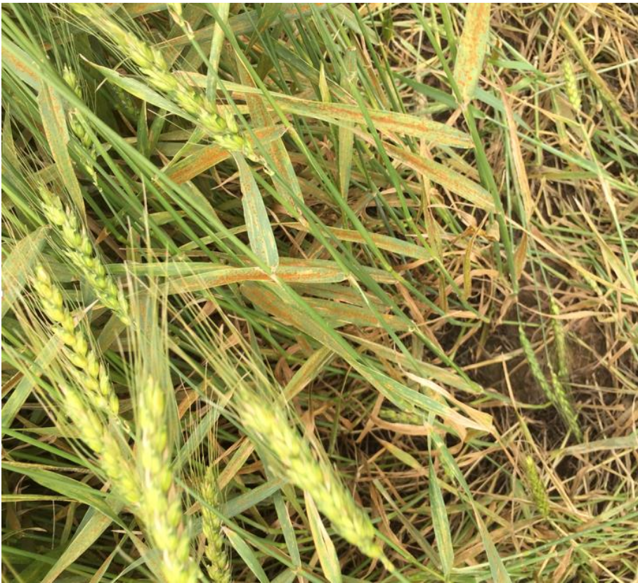
Figure 1. Severe leaf rust on wheat in southwestern OK near Altus