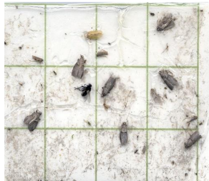
Seven moths in a trap