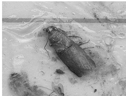
Close up of male moth in trap.