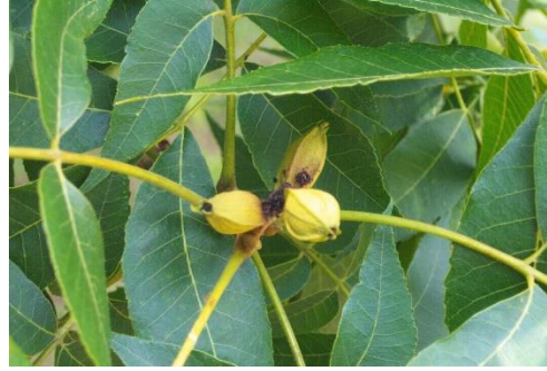
Damage indicated by frass near base of nut clusters