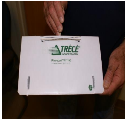
Trece, Inc. Pherocon VI trap.

The following list provides some companies that sell PNC pheromone traps. Only 3 traps are needed for 50 acres or less and at least 5 traps for 50 or more acres, but each grower may have separate areas that need monitoring. If you order pheromone and traps from any of these sites, DO NOT leave the pheromone source out at room temperature. The small rubber septa that contains the pheromone should be placed in the FREEZER until you place traps in the orchard. When traps are deployed, simply place the rubber septa in the middle of the sticky trap bottom.