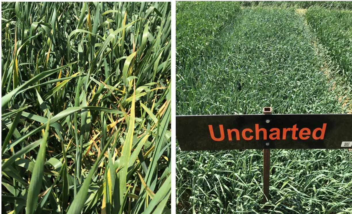
Figure 1. The photo on the left shows Barley yellow dwarf (BYD) infection on the wheat variety OK Corral. The photo on the right shows the BYD resistant variety Uncharted which was planted next to other infected plots. The photos were taken in the hard red winter wheat variety demonstration plots in Stillwater, OK on April, 15, 2022.

In my previous update on April 12, I reported barley yellow dwarf virus (BYD) infection on the susceptible wheat variety 'Pete' in the BYD nursery in the Stillwater Agronomy Research Station. Last week, Dr. Amanda De Oliveira Silva (OSU Extension small grains specialist) observed yellowing of the leaf tips in most of the hard red winter wheat variety demonstration plots in Stillwater (Figure 1). We performed Enzyme linked immunosorbent assay (ELISA) on symptomatic samples from different OSU wheat varieties including 'OK Corral', 'Strad CL Plus', 'Guardian', 'Baker's Ann', 'Showdown', and 'Breakthrough'. All samples were tested positive for BYD. In these demonstration plots, the variety 'Uncharted', which carries two BYD resistance genes, Bdv1 and Bdv2 , was the most resistant OSU wheat variety to BYD (Figure 1). Dr. Silva indicated that the plots planted earlier in September were more infected than the plots planted later in October. This shows the importance of breaking the 'green bride' to manage this virus which is transmitted by cereal aphids.