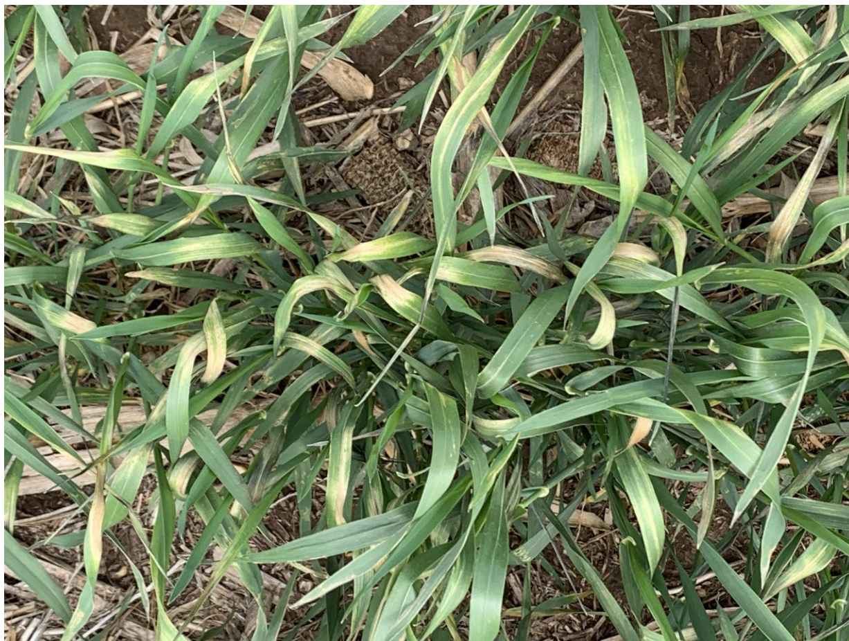
Figure 3. Freeze damage on the wheat variety ‘WB 4401’ (Garfield county, Oklahoma, photo by Kevin Brown on April 11, 2022).