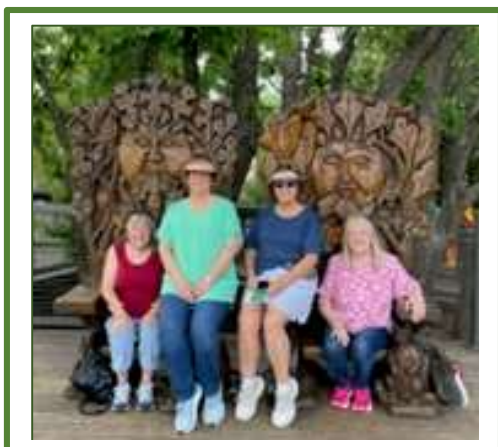
TULSA BOTANICAL GARDEN TOUR Pictured: Members and guest of Jenks OHCE enjoying their recent field trip to the Tulsa Botanical Gardens.