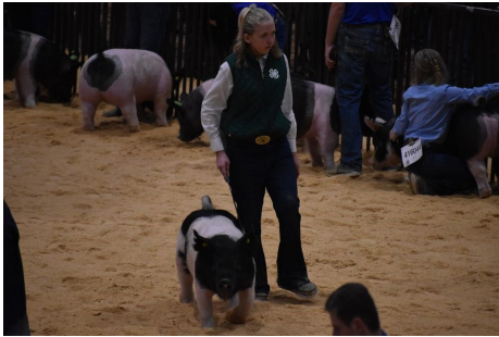
Tulsa County youth showing at Oklahoma Youth Expo