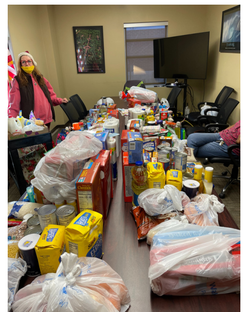
Nutrition Education Assistants working hard to provide Holiday Basket for families.