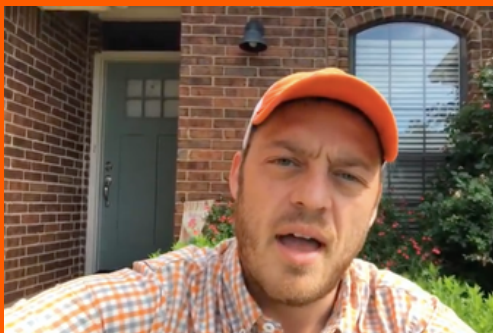
Simple Home Irrigation System Checkup to Prevent Water Waste

Click the photos above to be redirected to the corresponding video.