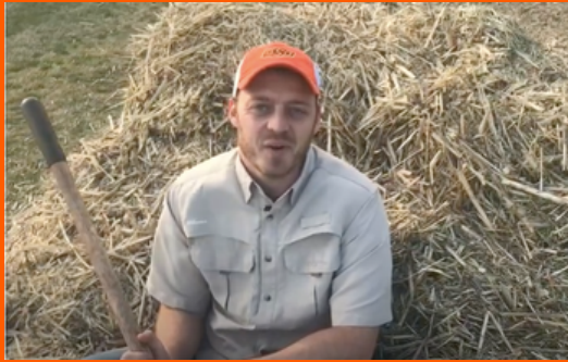
Mulching Garden Soils