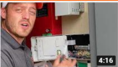
Installing a Smart Irrigation Controller

Click the photo to take you to the corresponding video on our YouTube channel.