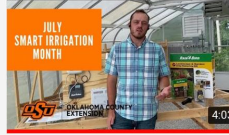
July - Smart Irrigation Month 7 views · 1 week ago

Oklahoma County OSU Extension continues to fulfill its mission of serving Oklahoma County with research-based information and services to help residents improve their lives. We have continued this during the pandemic by providing timely, educational media content through regular television appearances, YouTube and Facebook postings.