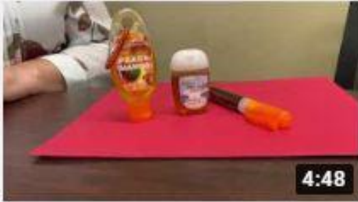
Hand Sanitizer Safety