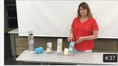
Bathroom Safety for Small Children No views · 1 day ago