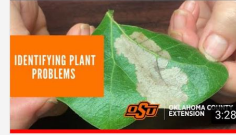
Identifying Plant Problems 2 views · 4 days ago