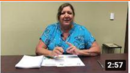
Grow Your Own Fall Garden

https://www.youtube.com/channel/UCB9BldNoz0SA3wh0HfZAm2g?view_as=subscriber