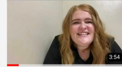
Leadership Series: Responsibility & Goal Setting 8 views · 5 days ago