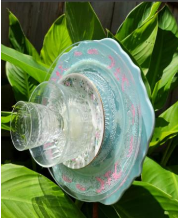
Dishes glass garden art

The OHCE SE district meeting a few years ago had a hands on $5 class for making glass garden art. Old unusable dishes and bowls plus some E 6000 glue created magic. This is a similar piece being offered for $70 on eBay. The flower is drought tolerant, pest free, and requires no weeding or fertilizer for it to thrive.