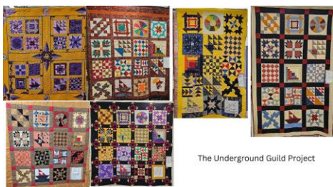
The Underground Guild Project