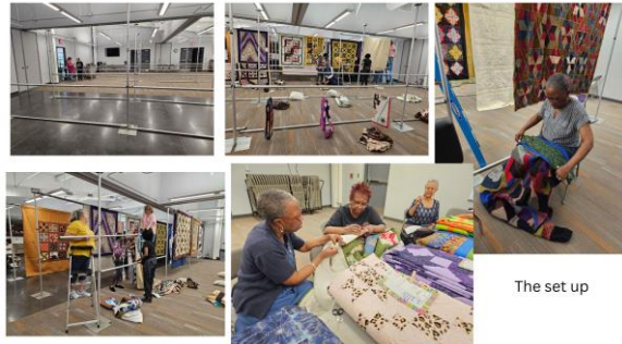
The set up