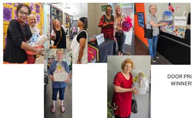
DOOR PRIZE WINNERS