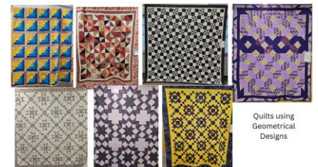
Quilts using Geometrical Designs