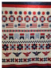
Red, White and Blue