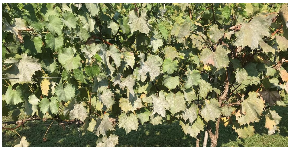
Figure 1. Post-harvest 'Chambourcin' vine with powdery mildew infection.

Maintain disease control – disease control is critical for keeping vines healthy for future harvests, a vine left to diseases after harvest (Fig. 1) may have reduced crop or cold-hardiness in future years due to increased disease inoculum and stress.