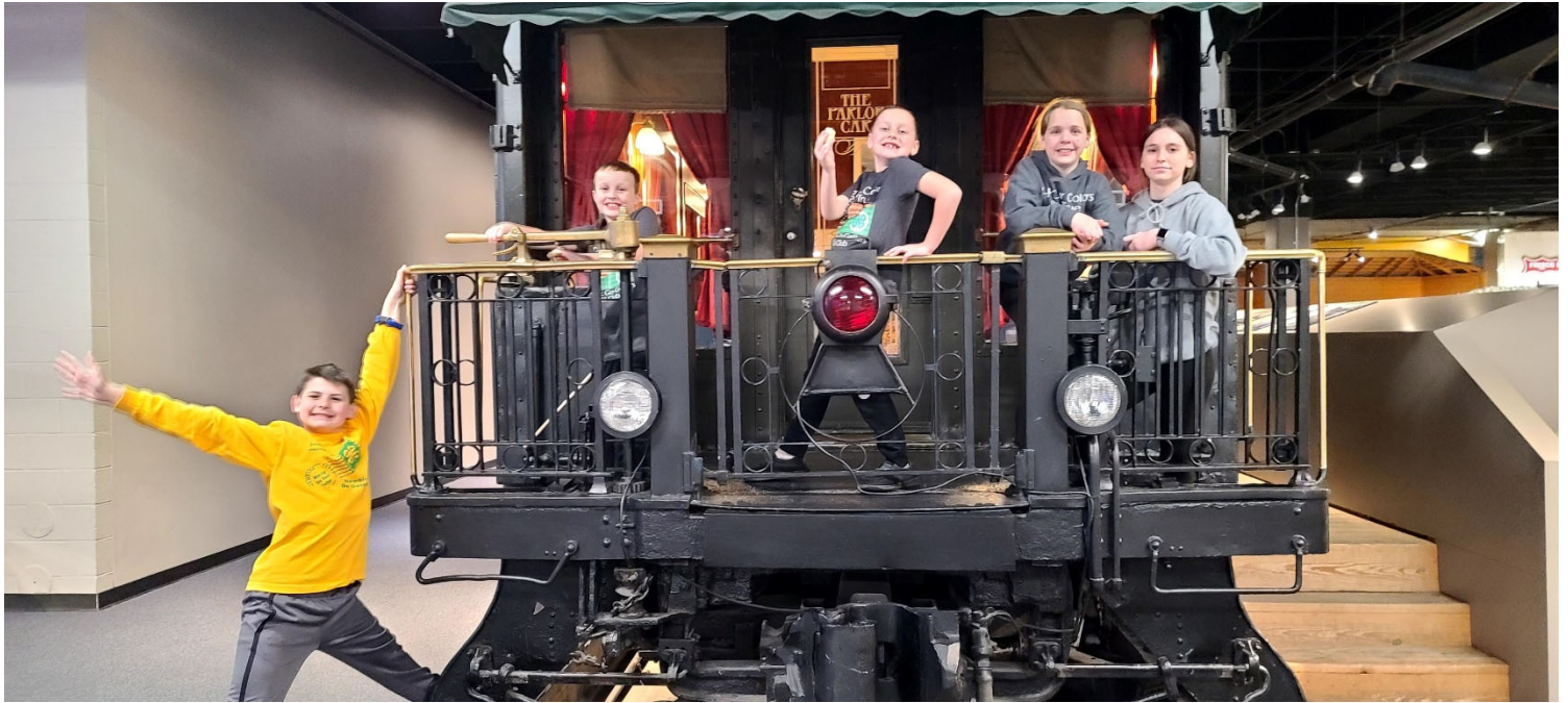
Oklahoma 4-H annual 4-H Night at the Science Museum. Kay County 4-H'ers Experience what it's like to be a real-life detective or forensic scientist as we lift fingerprints, extract DNA, interrogate suspects, and much more! The science of solving crimes at the Science Museum.