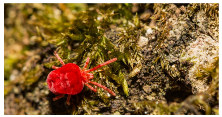
Chiggers are non-burrowing mites and do not transmit disease.

To relieve chigger bites, use common antihistamines or creams that counteract the skin's inflammatory response.