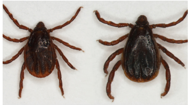
Figure 6. Brown Dog Tick ( Rhipicephalus sanguineus ) female (L) male (R).

The adult ticks are most often found in the ears and between the toes of dogs. The larvae and nymphs are found in the long hair on the back of the neck. The eggs are deposited in cracks and crevices of the dog kennel. These ticks have a tendency to crawl upward and are commonly found in cracks in the roof of dog kennels or ceilings of porches. These ticks will also become established in houses and other buildings that are inhabited by dogs. The brown dog tick transmits a wide range of pathogens to dogs that include Anaplasma platys , Babesia canis , Babesia gibsoni , Ehrlichia canis , Hepatozoon canis and Rickettsia rickettsii .