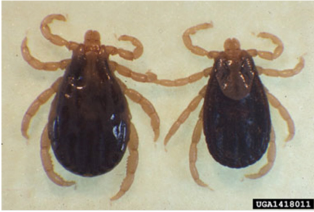
Figure 4. Winter Tick ( Dermacentor albipictus ) male (L) female (R).