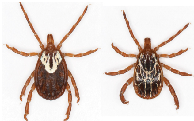
Figure 8. Gulf Coast Tick ( Amblyomma maculatum ) female (L) male (R).

The Gulf Coast tick (Figure 8) is a three-host tick. As larva and nymph, the Gulf Coast tick is a common pest of ground-inhabiting birds, such as meadowlarks and bobwhite quail or small rodents. The adults primarily blood feed on cattle, but a variety of other hosts including dogs, horses, sheep, deer, coyotes and humans can be parasitized. This tick has become increasingly abundant in Oklahoma in the past 20 years and is an important pest of cattle. It transmits Hepatozoon americanum to dogs and coyotes, and possibly Rickettsia parkeri to humans. The adults attach to the ears of cattle and are most abundant in early April to mid-June. When infestations are high on cattle, the ears may become thickened and curled causing a condition called “gotch ear.” This tick reportedly has produced tick paralysis in humans and dogs.