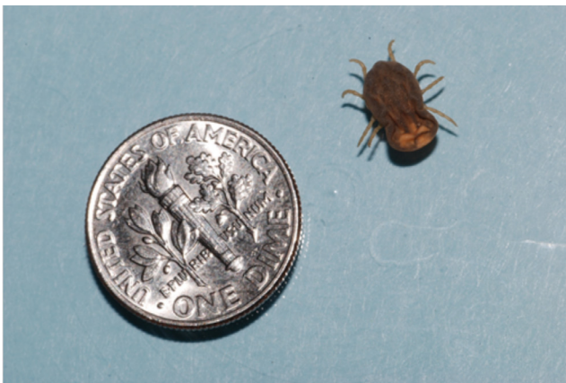
Figure 2. Spinose Ear Tick ( Otobius megnini ) nymph.

The larval and nymphal stages are blood feeders, with the adult being non-parasitic. Larvae and nymphs are the only life stages found in the ears. The nymph is easily recognized by spines on the integument and the peanut shape of the body. After the last feeding, the nymph leaves the host and molts to the adult stage. Males and females mate on the ground and females lay their eggs under feed bunks, boards and other suitable protected areas. The newly hatched larvae crawl up feed bunks or other objects and await contact with a passing host.