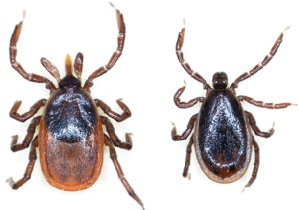
Figure 3. Deer tick or Black-legged tick ( Ixodes scapularis ) female (L) male (R).

The adults become active in late September and October and are present until March or April. During the early fall, it is often the most common tick on deer and cattle in Oklahoma. The larvae and nymphs are active in the spring and summer and feed on snakes and lizards. In Oklahoma, the black-legged tick is not known to transmit Lyme disease, because the larval ticks do not feed on mice that serve as reservoir hosts for the bacteria.