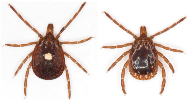
Figure 7. Lone Star Tick ( Amblyomma americanum ) female (L) male (R).