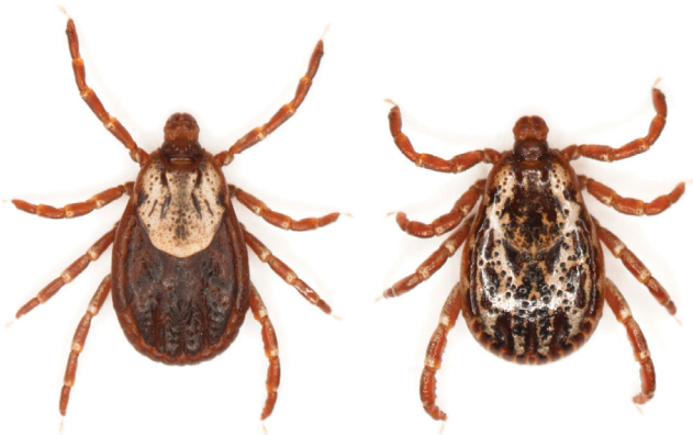
Figure 5. American Dog Tick ( Dermacentor variabilis ) female (L) male (R).

The American dog tick is the only known vector of Rocky Mountain spotted fever (RMSF, Rickettsia rickettsii ) in Oklahoma. This tick is also a vector of bovine anaplasmosis ( Anaplasma marginale ), feline cytauxzoonosis (cats, Cytauxzoon felis ), canine monocytic ehrlichiosis ( Ehrlichia canis ) and human monocytic ehrlichiosis (HME, Ehrlichia chaffeensis ), and is also known to cause tick paralysis in people and dogs. The larval and nymphal stages have been known to survive two years or longer without feeding. Under suitable conditions, the life cycle from egg to adult may require only three months, but usually the life cycle requires at least one year.